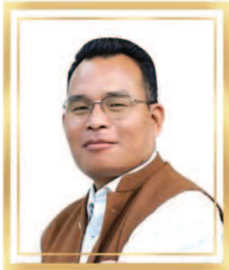
Shri Rakkam A Sangma Hon'ble Education Minister Govt. of Meghalaya