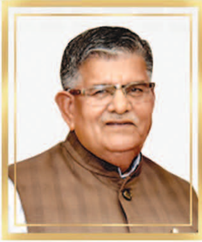
Shri Gulab Chand Kataria Hon'ble Governor of Assam