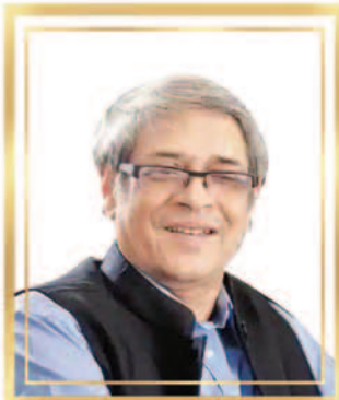
Padma Shri Dr. Bibek Debroy Hon'ble Chairman, Economic Advisory Council to Hon'ble Prime Minister of India