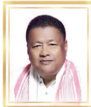
Dr. Ranaj Pegu Hon'ble Minister of Education Govt. of Assam