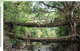
Double-Decker Living root bridge