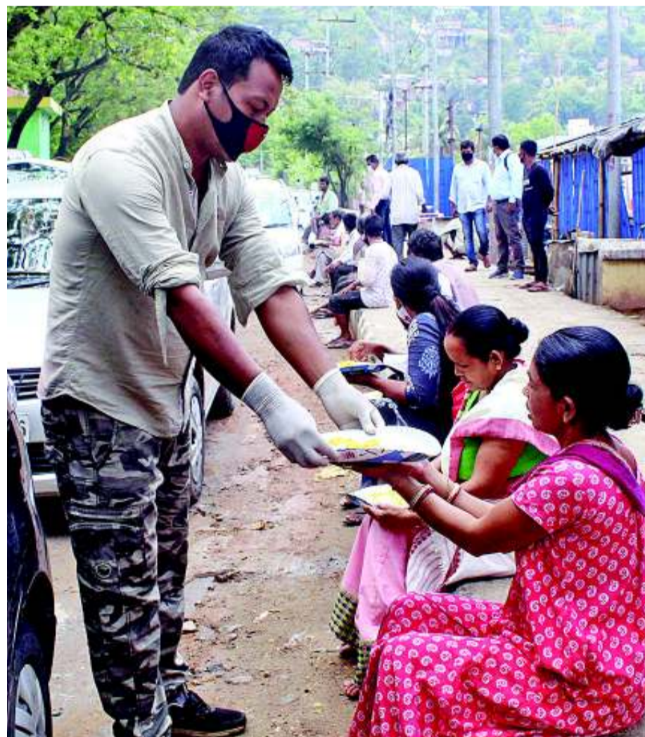
A woman selling face masks amid the nationwide lockdown in Guwahati on Friday.