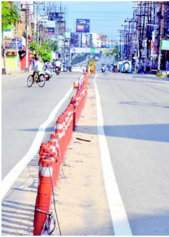
A road at Paltan Bazar witnesses a thin crowd during the lockdown in Guwahati on Friday.

On arrival at the destination, passengers will be received by the state government, who would make all arrangements for their screening, quarantine if necessary and further travel from the railway station, the statement said.