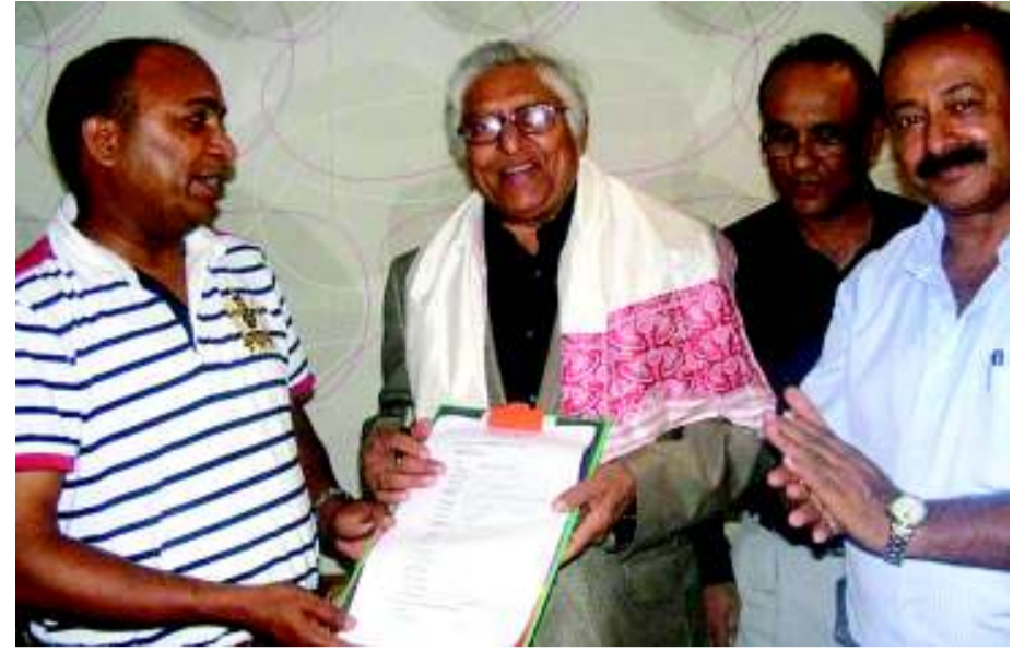
A file photo of Chuni Goswami at Gauhati Town Club.

NEW DELHI, May 1: [All India Football Federation (AIFF) condole the death of former India captain Subimal Goswami, who was fondly referred to as Chuni Goswami by his vast legion of fans. Goswami breathed his last in Kolkata on Thursday at the age of 82.