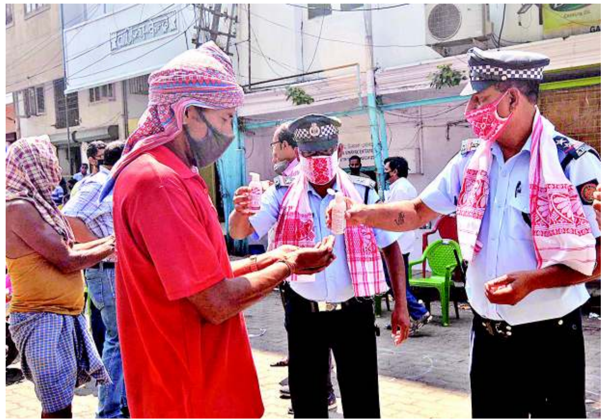
In sync with May Day, labourers being given hand sanitiser during a felicitation programme organised by the Kamrup Chambers of Commerce and Panbazar police, in Guwahati on Friday.

Sesame Workshop is also developing new content including animations on healthy habits, resources providing comfort, and learn-at-home activities on topics including reading, math and science, which will be available in English and many regional languages, including Assamese.