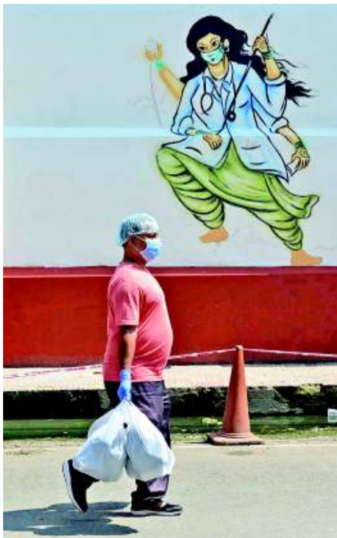
A man walking past a coronavirus-themed graffiti on wall amid lockdown, in Guwahati on Friday.