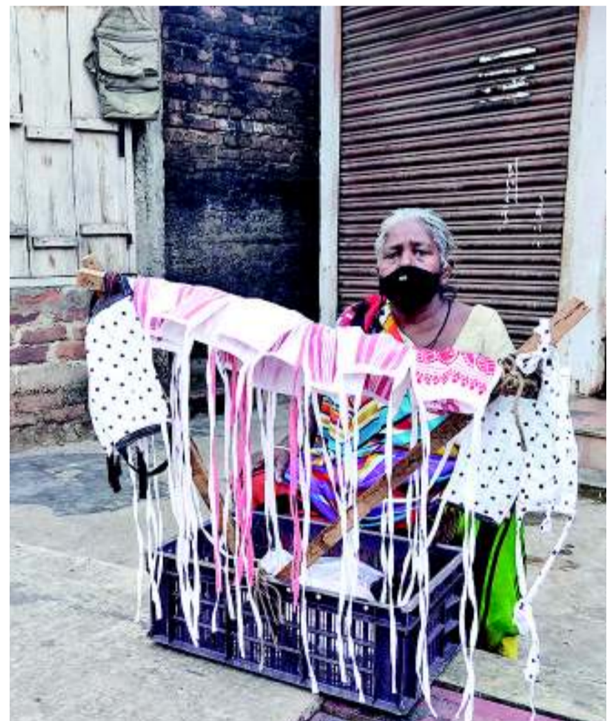
Members of an NGO distributing food to needy people near GMCH on Friday.