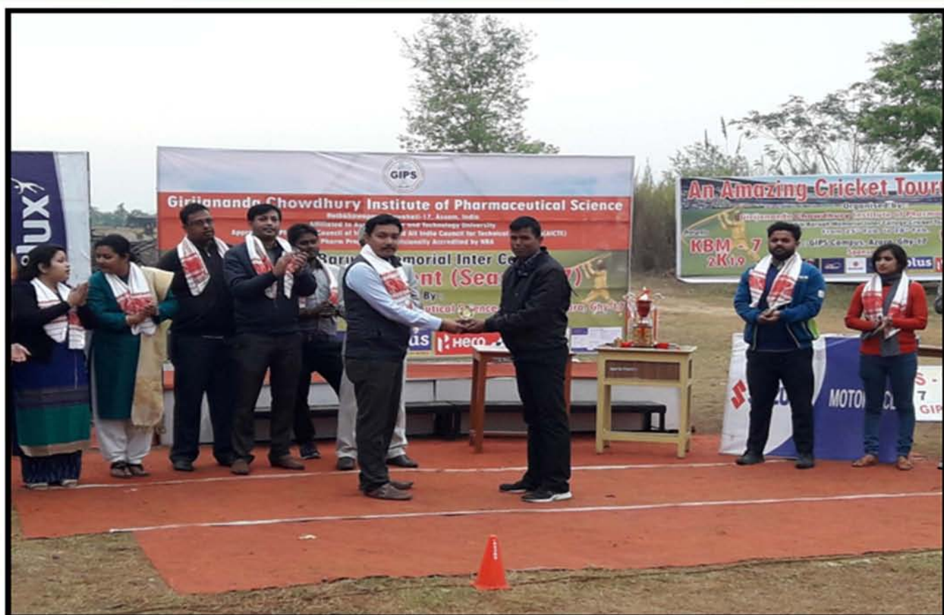
Kaushik Baruah Memorial Cricket Tournament, Best Discipline Team Award