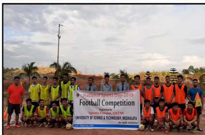
National Sports Day 2015, Football Competition