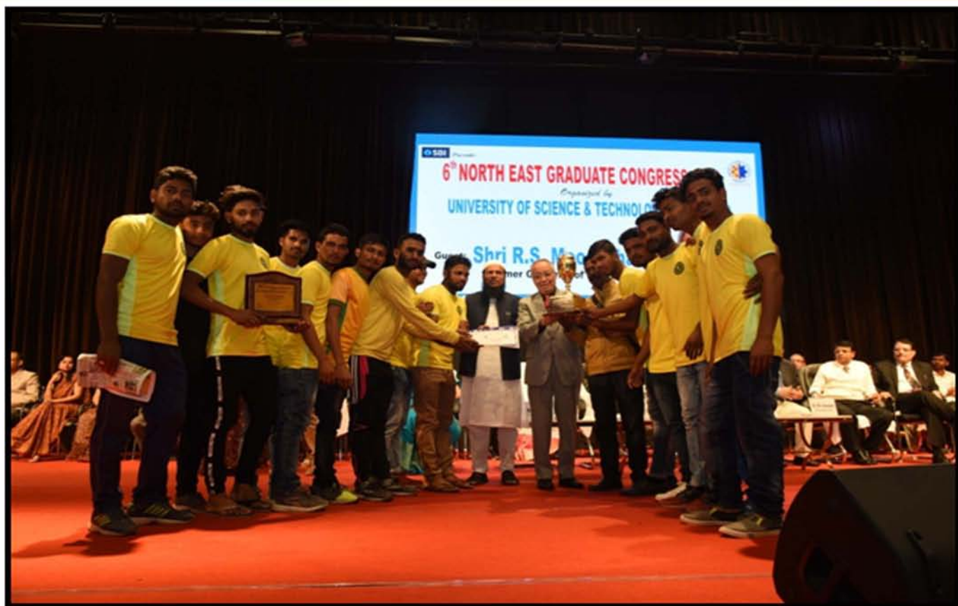
North East Graduate Congress (NEGC)-2019 Cricket Award