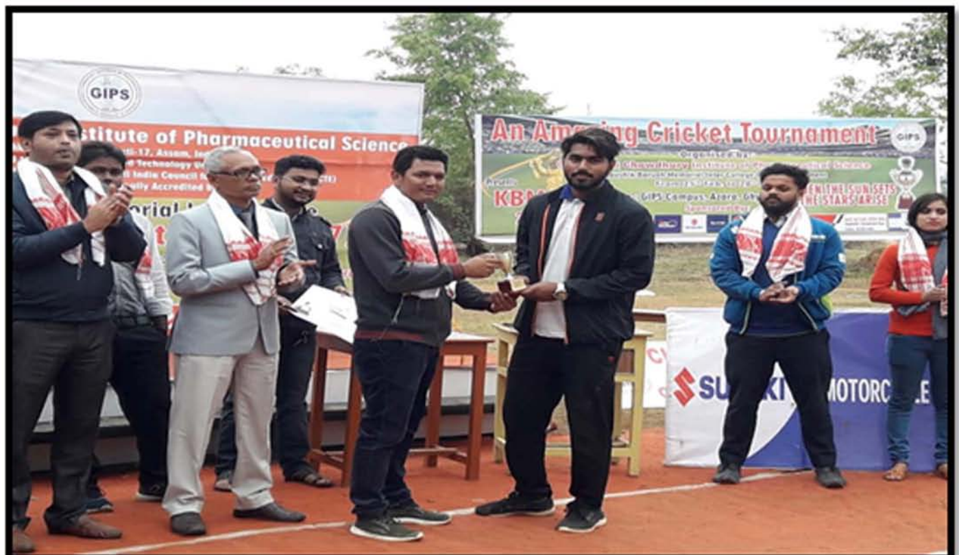
Kaushik Baruah Memorial Cricket Tournament, Best Batsmen Award