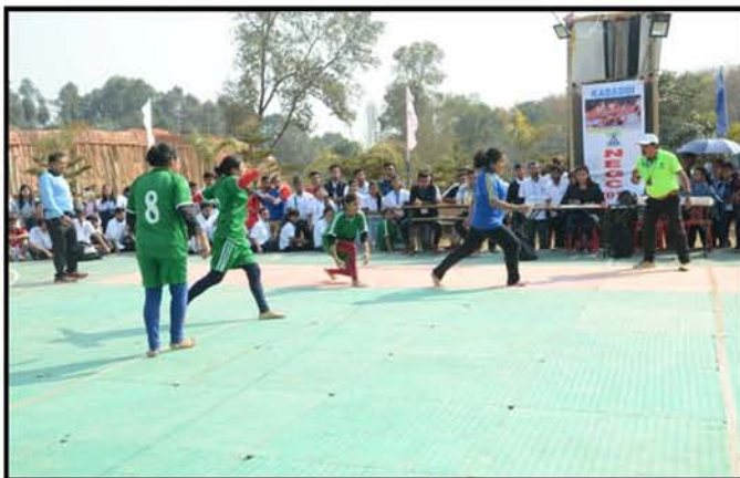
NEGC, Women Kabaddi Competition