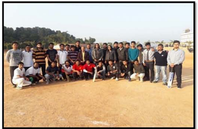
Varsity Week, Cricket