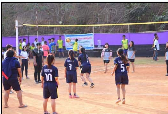
Volleyball Competition, NEGC