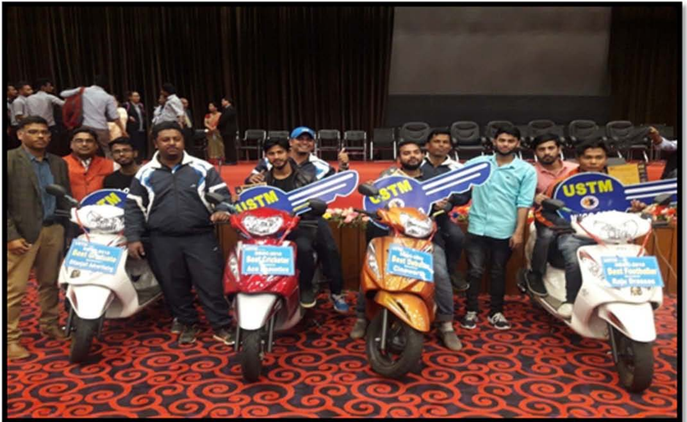
Best Player Award of Different games in North East Graduate Congress (NEGC)