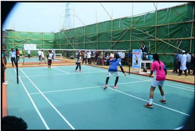
NEGC 2019, Badminton Competition (Women)