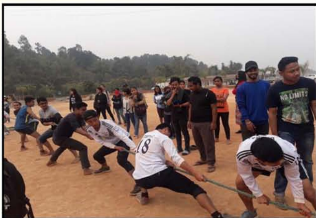
Tug of War Competition