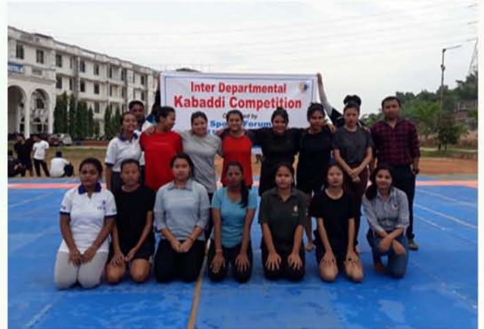
Inter Departmental Kabaddi Competition