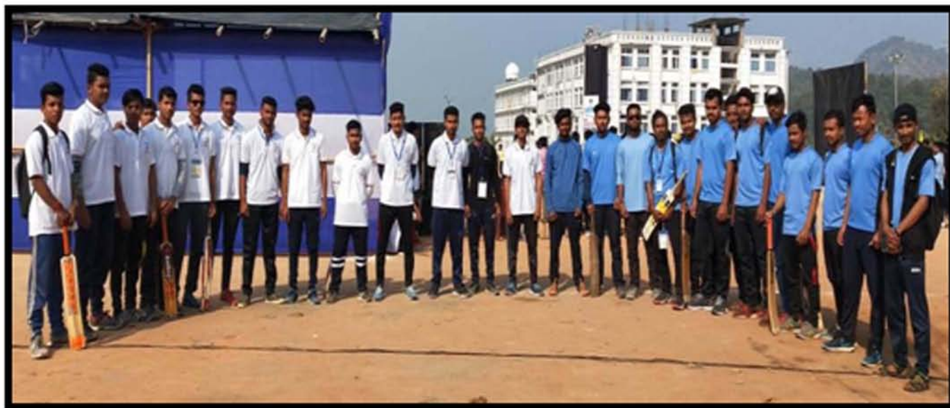
Inter Departmental Cricket Competition