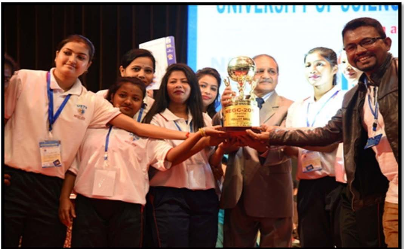
North East Graduate Congress (NEGC) 2019, Volleyball Winner