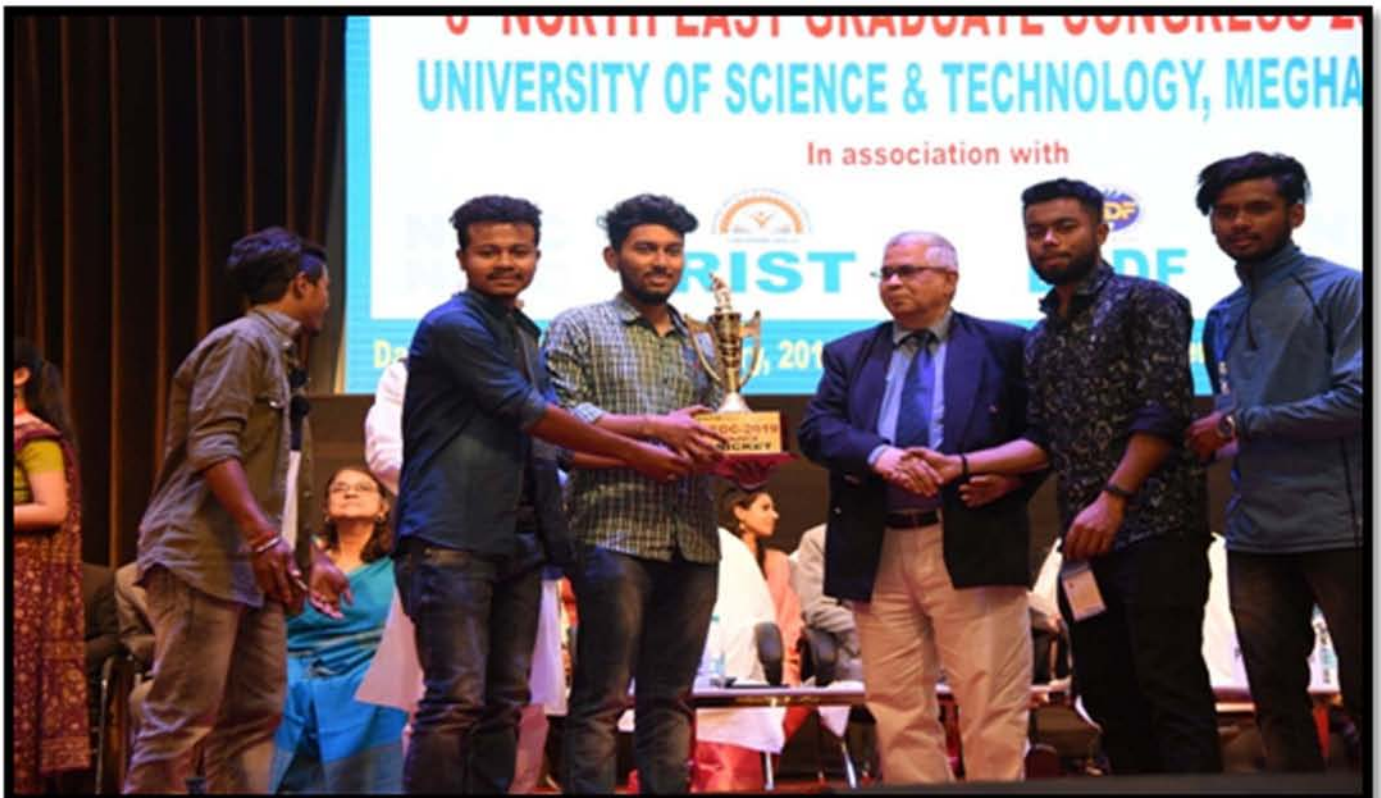
Cricket Winner, North East Graduate Congress (NEGC)-2019