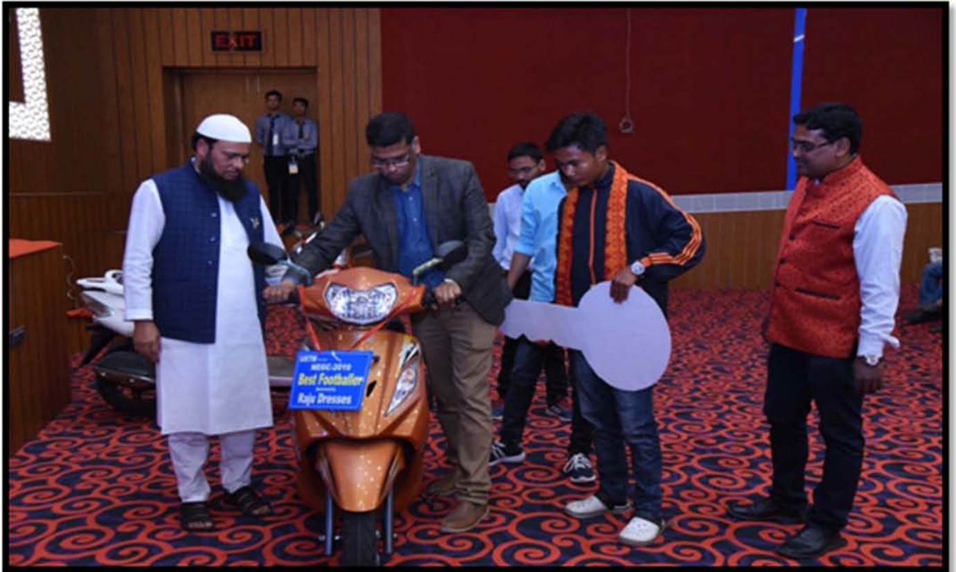
Best Players in Football, North East Graduate Congress (NEGC)-2019