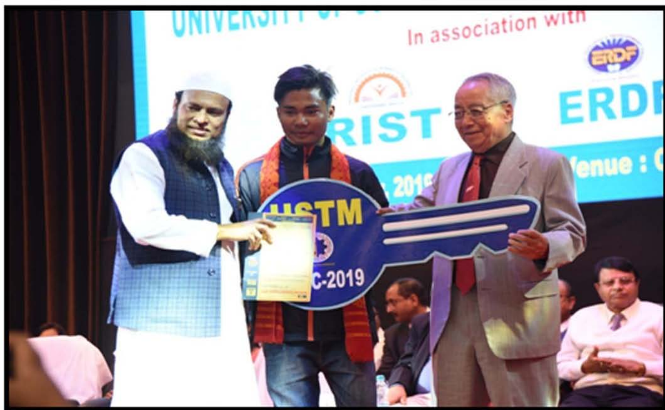
Best Players in Football, North East Graduate Congress (NEGC)-2019