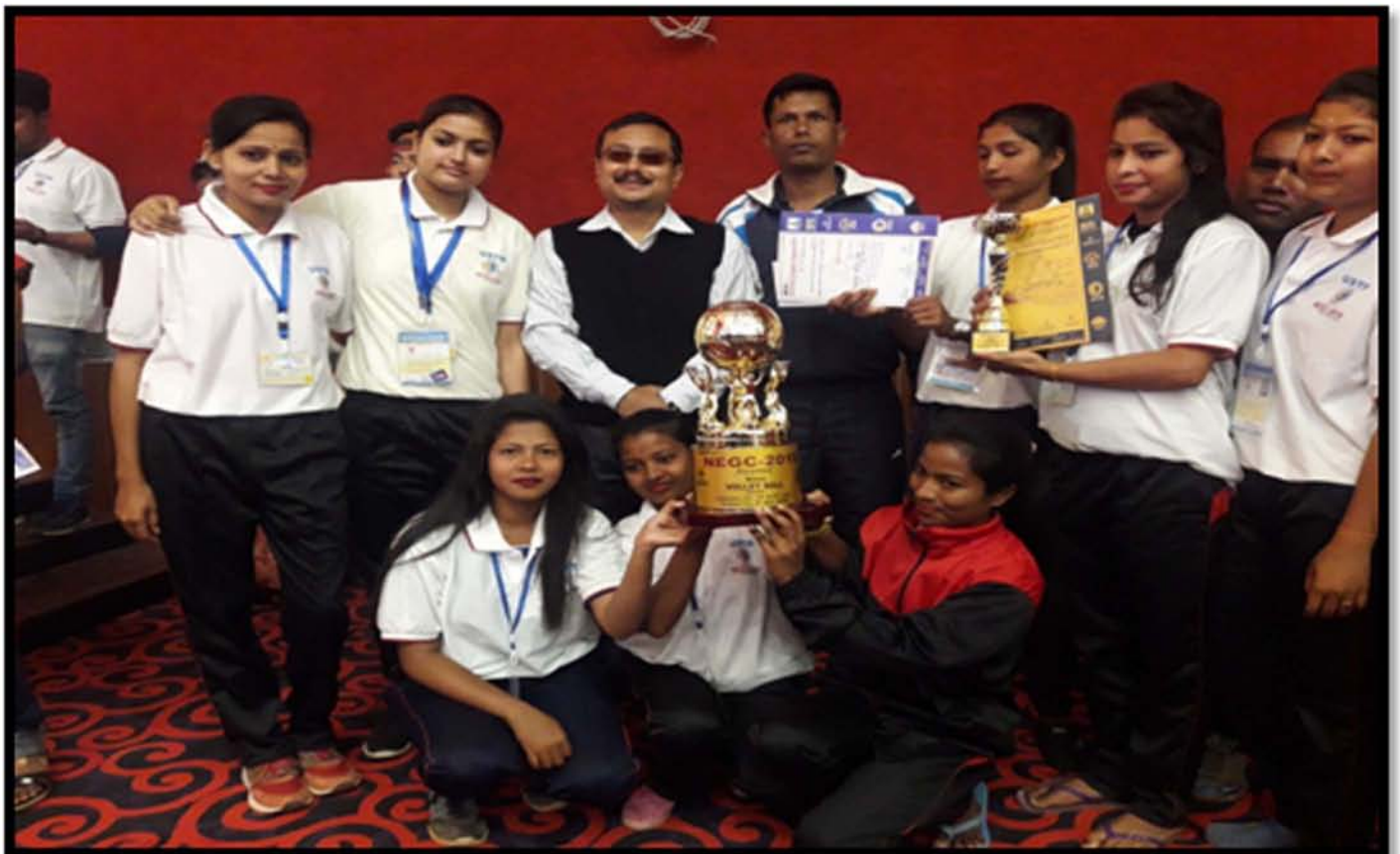
North East Graduate Congress (NEGC) 2019, Volleyball Winner