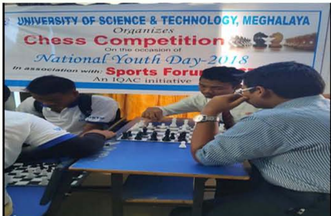
National Youth Day 2018, Chess Competition