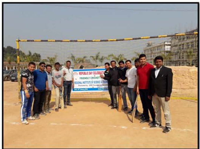
Republic Day, Friendly Cricket Match, Admin. Vs Faculty