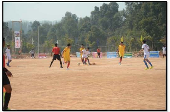
Futsal Competition, NEGC