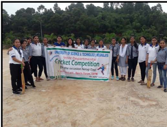
Netaji Day, Inter Department Cricket Competition (Women)