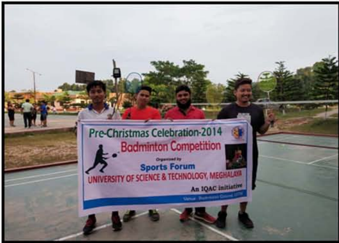
Pre-Christmas 2014, Badminton Competition