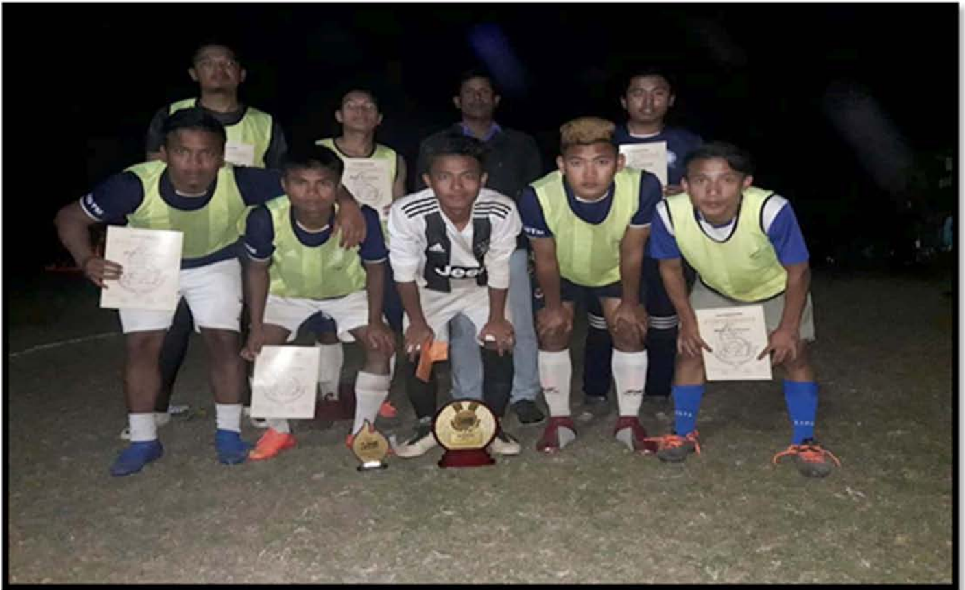
PYROKINESIS, Organized by Assam Engineering College, Winner Award on Futsal