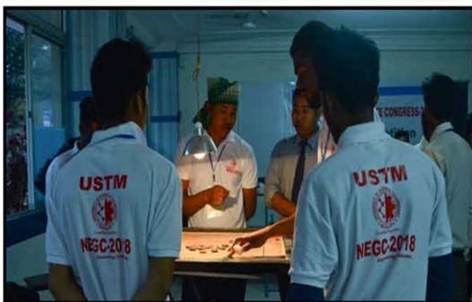
Carom Competition for North East Graduate Congress