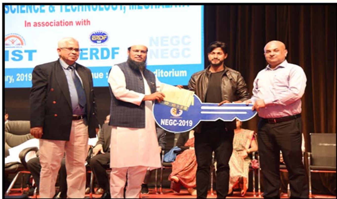
Best Player in Cricket, North East Graduate Congress (NEGC)-2019