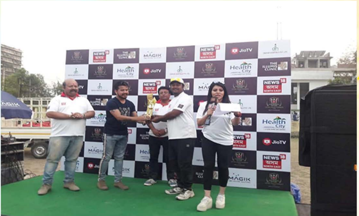
Guwahati Hlt and run cricket, Runners up Award