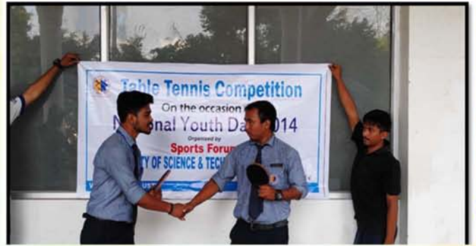
National Youth Day 2014, Table Tennis Competition