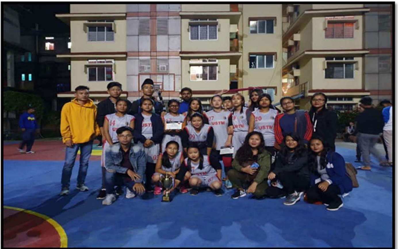
NERICT, Basketball Runners up award