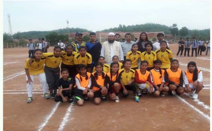
Kho Kho Competition