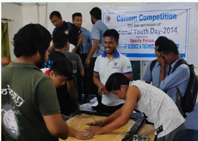
National Youth Day 2014, Carom Competition