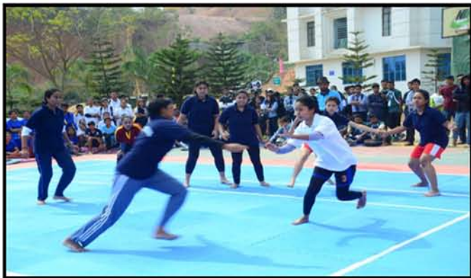
Kabbaddi Competition (Women)