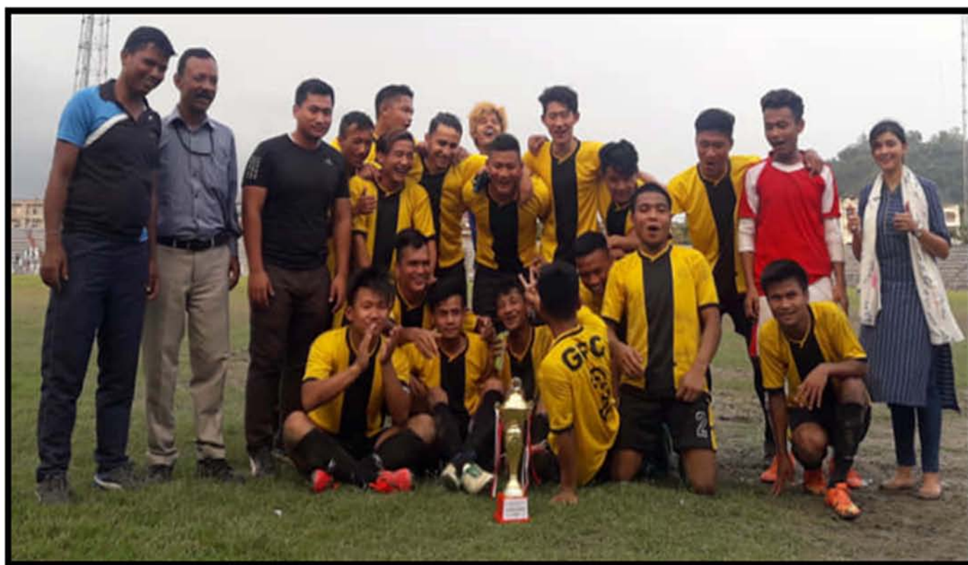
C- Division Football Winner, 2019