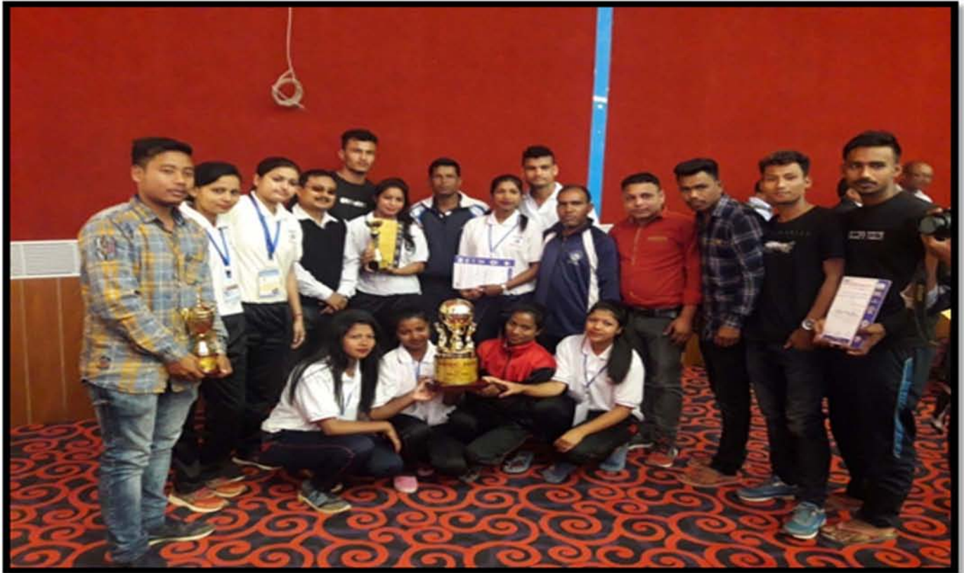
North East Graduate Congress (NEGC) 2019, Volleyball Winner