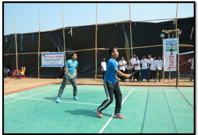
NEGC 2018, Badminton Competition