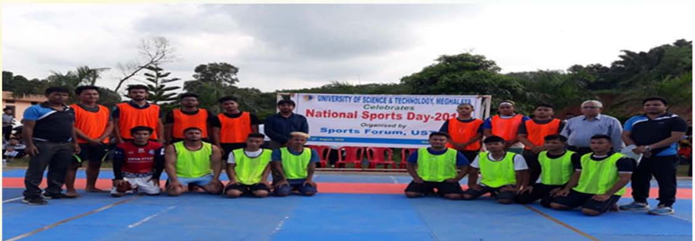
National Sports Day, Kabaddi Competition