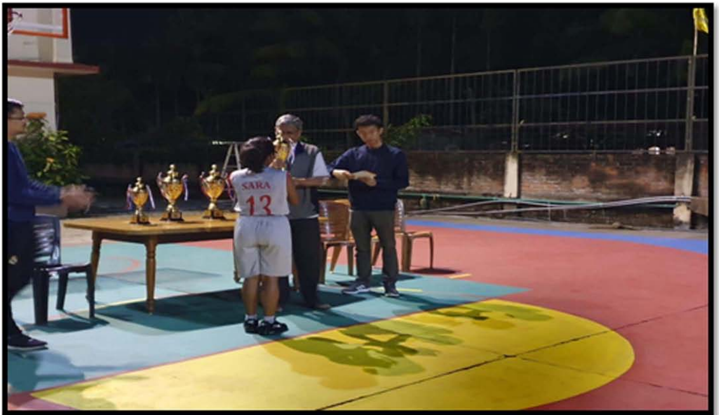
NERICT, Basketball Runners up award