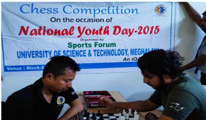
National Youth Day 2015, Chess Competition