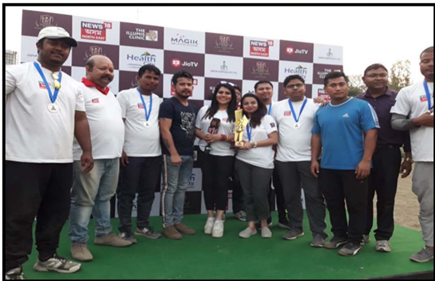
Guwahati Hlt and run cricket, Runners up Award