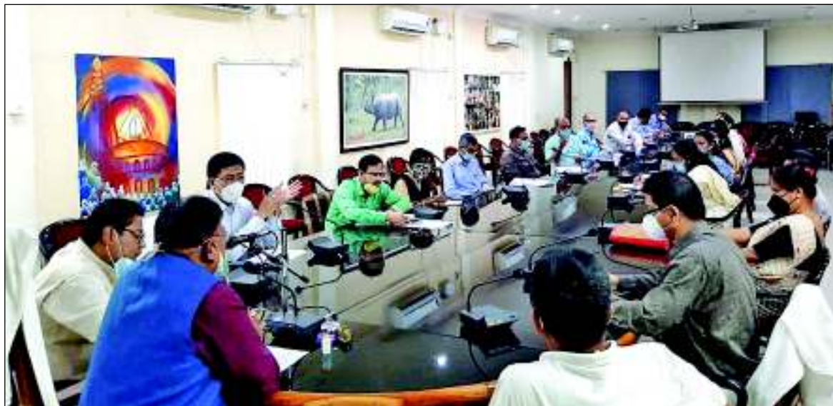
A high-level meeting discussing arrangement of quarantine facilities in Sivasagar.