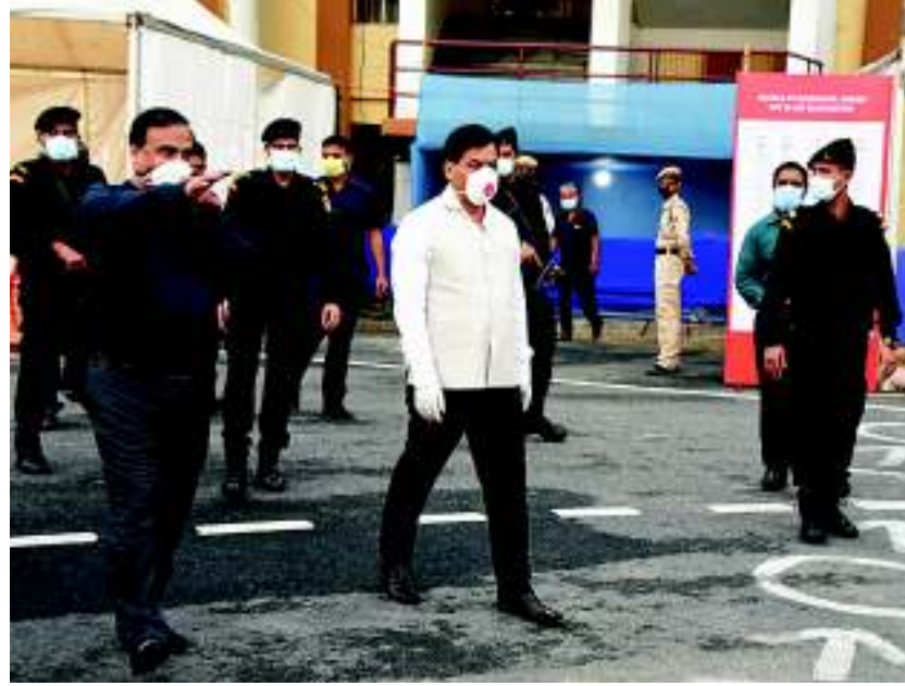
Chief Minister Sarbananda Sonowal and Health Minister Himanta Biswa Sarma visiting COVID-19 quarantine facilities at Sarusajai in Guwahati on Thursday.