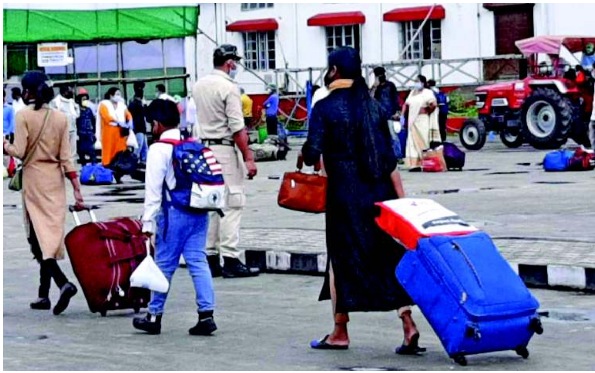
Passengers, who arrived on a special train from New Delhi, seen at the New Dibrugarh railway station on Thursday.