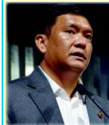
Shri. Pema Khandu Hon'ble Chief Minister