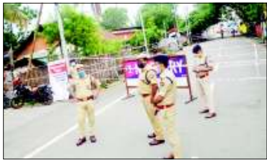
Security personnel at Panbazar Railway Colony.