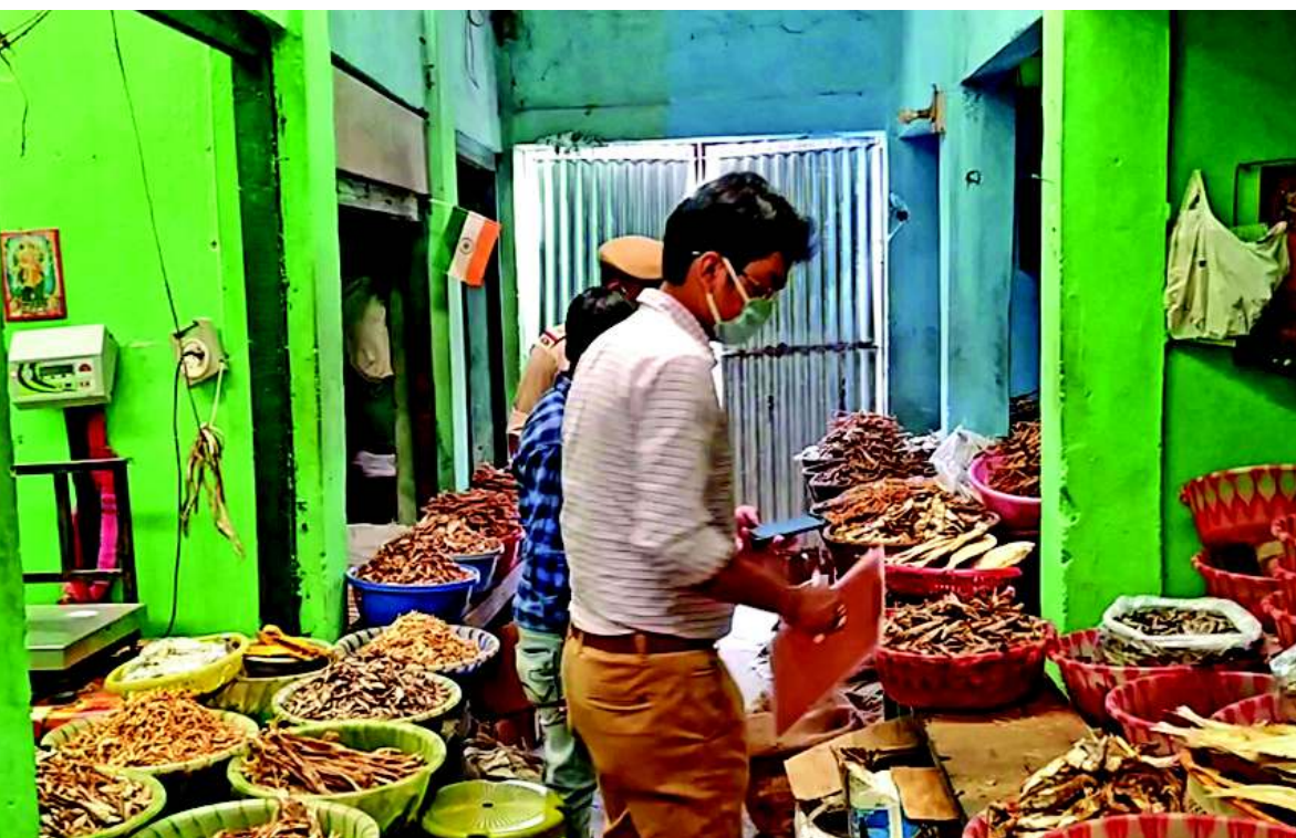
District administration officials sealing an unhygienic dry fish market, at Sonari on Thursday.

Depending on their COVID-19 status, steps will be taken to send them back to their respective destinations, said sources.