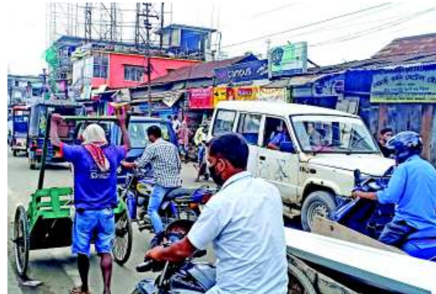
Heavy traffic at Rangiya town during the third phase of lockdown, as seen on Thursday.

The old building of the hospital has been transformed into a complete COVID-19 hospital with all facilities, where altogether 150 patients could be accommodated.