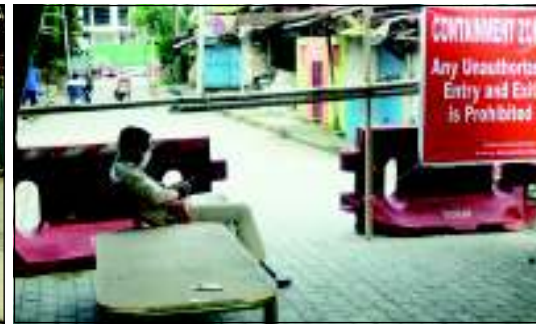
A policeman keeps watch at Fatasil GS Colony.