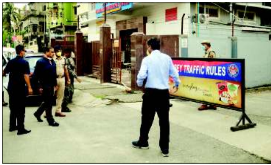
Health Minister Himanta Biswa Sarma at Kumarpara.