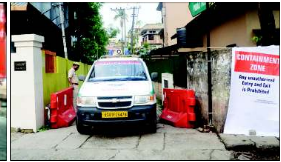
An ambulance seen at Santipur.