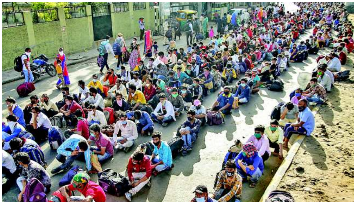
Migrants wait for a means of transport to reach a railway station and board a special train to their native places in Uttar Pradesh, in Ahmedabad on Thursday. - PTI

Students will sit in their homes and will download question papers for their respective course from the portal. They will upload the answers in a span of two hours. - PTI