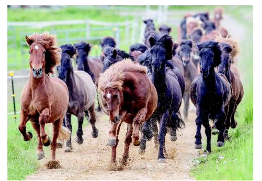
Icelandic horses go wild as they are for the first time in the season driven from their stable to a meadow on a stud farm in Wehrheim near Frankfurt, Germany on Thursday. - AP/PTI

The newly-reported six confirmed domestically transmitted cases in the Chinese mainland on Tuesday were all related to previous cluster infections, Song Shuli, a spokesperson for the NHC told the media here in Beijing on Wednesday. - PTI