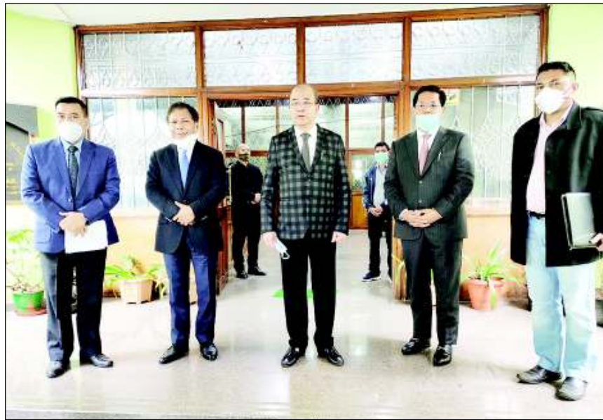
Meghalaya Assembly Speaker Metbah Lyngdoh addressing media persons after an all-party meeting on COVID-19 in Shillong on Thursday. Chief Minister Conrad Sangma and Leader of Opposition Dr Mukul Sangma are also seen.

quarantined at the BSF Hospital at Salbagan. A total of 11,733 samples were collected for COVID-19 tests in Tripura so far, out of which tests were conducted on 11,146 cases. Eighteen COVID-19 patients have recovered from the disease and there has been no casualty till date. Meanwhile, the State Government has decided to increase the manpower engaged in the ongoing battle against the COVID-19 pandemic. As many as 24 doctors and an equal number of nurses will be appointed on an urgent basis to augment the shortage in skilled manpower. All the new appointments will be made on contractual basis. A doctor will receive a month pay package of Rs 50,000, while a nurse will get Rs 20,000.