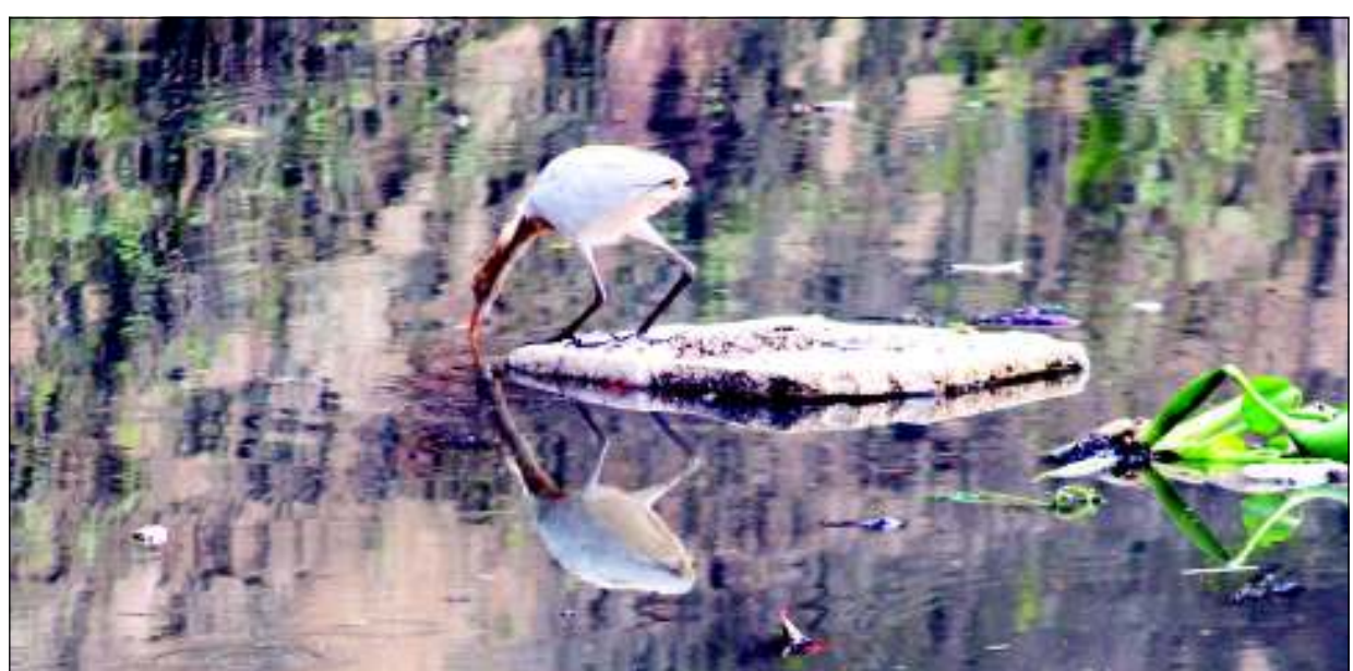
A cattle egret seen in the Bharalu river in Guwahati on Thursday.

From March 24 to May 3, the highest 137 road accidents were reported in Kamrup district, followed by Nagaon district (96) and Sonitpur district (79). From May 4 to May 11, highest 35 cases were reported from Nagaon district, followed by Golaghat district (34) and Kamrup district (26).