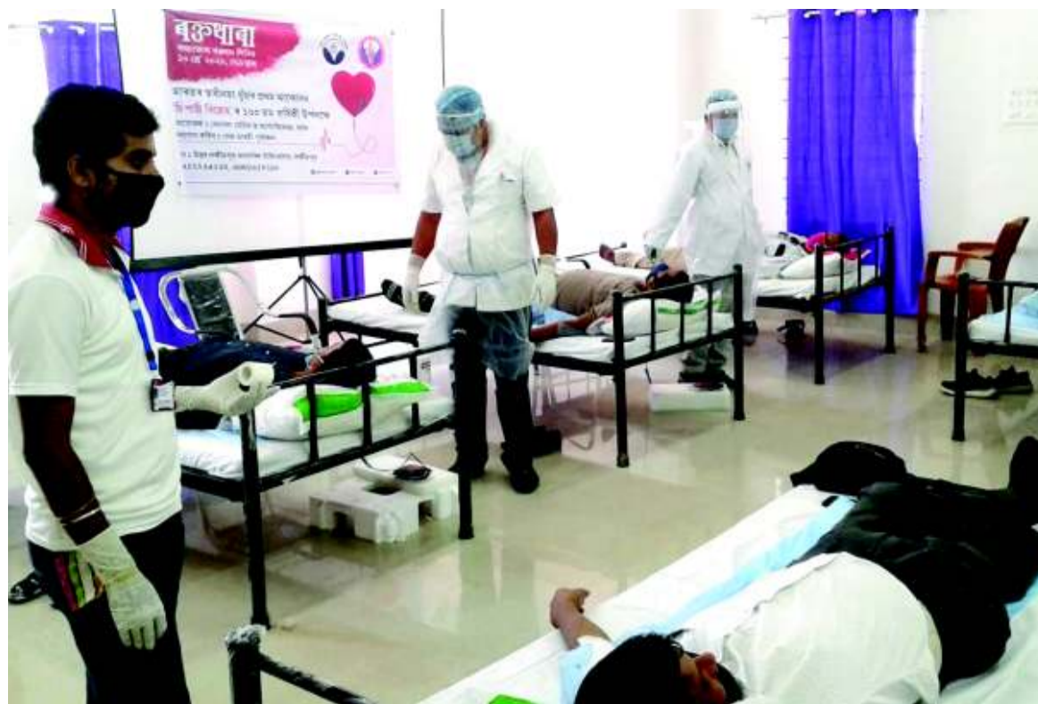
Extending blood bonds beyond kinship: Rakta-Dhara Statewide Voluntary Blood Donation Camp being held to mark 163 years of Sipahi Vidroh, organised by National Medicos Organisation at North Lakhimpur, on Sunday.

On the other hand, he assured that more precautionary measures would be taken in the quarantine centres. "It is time to face the challenge and we will have to be more cautious. Uptil now, a total of 126 people have been tested in the TU Zonal Screening Centre," he mentioned.