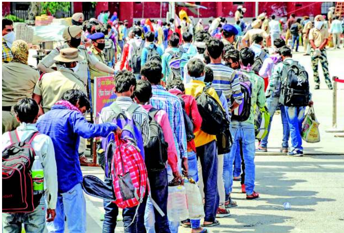
Migrants arrive at Amritsar Railway Station by buses to board a special train for Barauni in Uttar Pradesh on their way back to home, amid the lockdown, in Amritsar on Sunday.

Senior railway officials say the national transporter has a capacity to run around 300 trains per day ferrying around 20 lakh migrants in a maximum of five days.