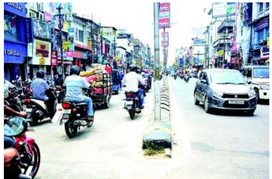
Commuters on a street in Agartala town following relaxation of lockdown norms, on Monday.

Thoubal police collected Rs 6,66,890 as fine while Bishnupur and Imphal West district collected Rs 4,57,190 and Rs 2,79,430 respectively. Churachandpur police collected a total of Rs 93,000 while Tamenglong and Kangpokpi collected Rs 44,400 and 19,550 respectively.