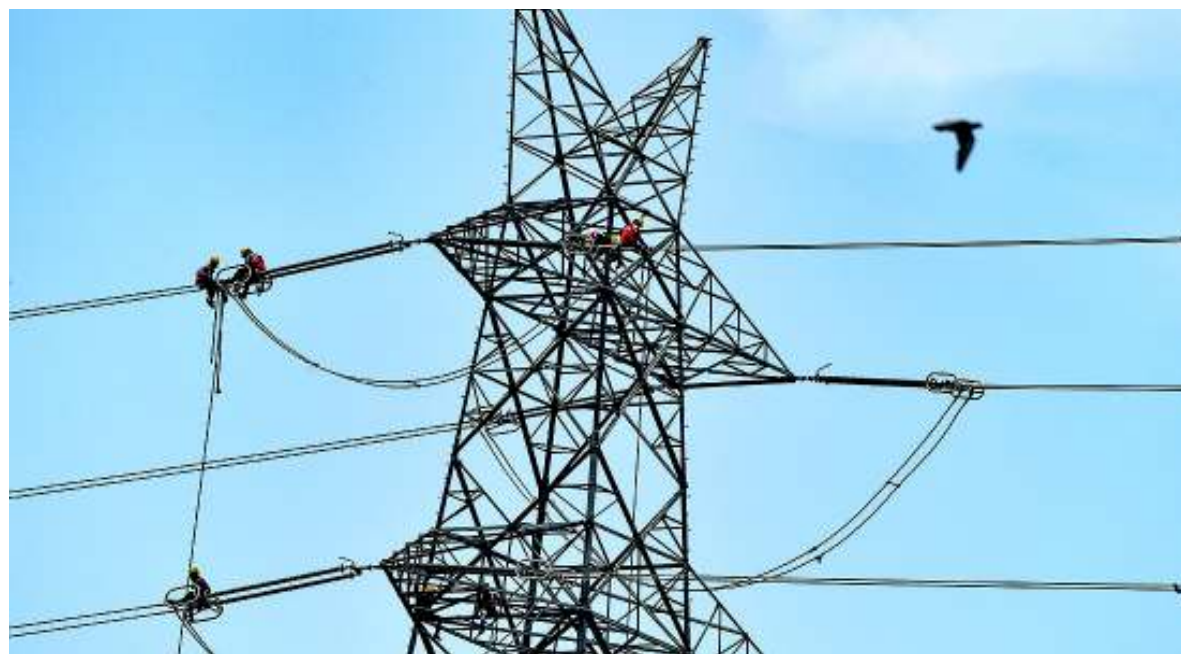
Lineworkers install new high-tension power cables after the government permitted to resume work at construction sites during the ongoing nationwide lockdown due to COVID-19 outbreak, in New Delhi on Monday. – PTI

The cool weather kept the power demand low despite partial easing of the lockdown from April 20. – PTI