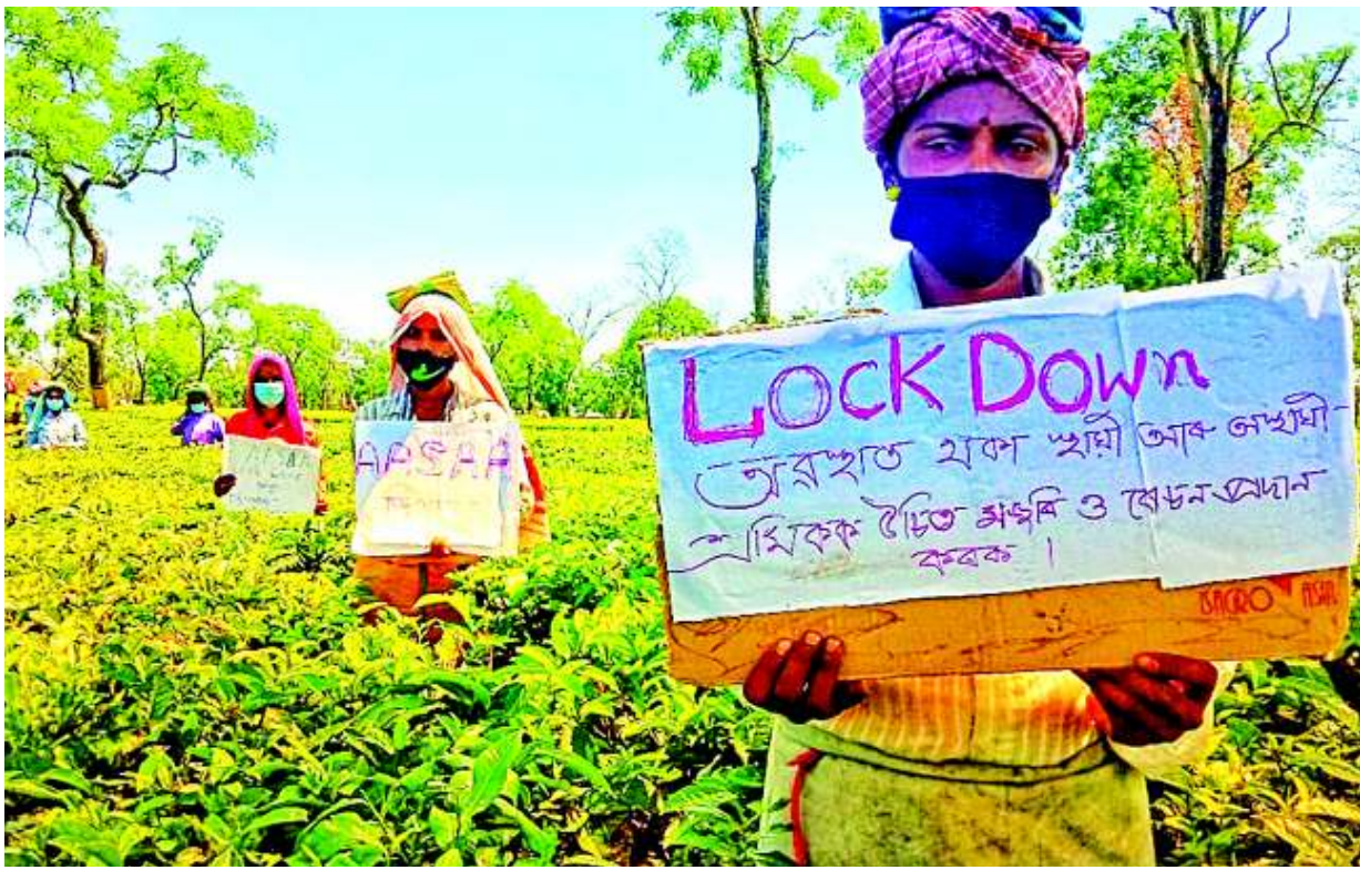
Workers in Shalmari tea estate in Dibrugarh district hold placards demanding full wages and rations for casual as well as permanent workers as per directive of the government, on Monday.