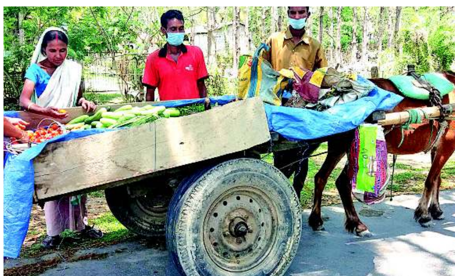
People buying vegetables being sold in a horse cart during the third phase of nationwide lockdown, at Howraghat on Monday.