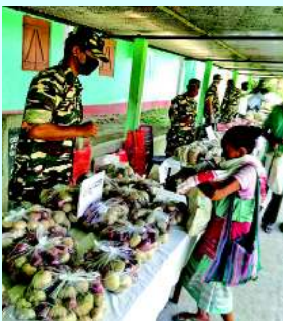
Officials and security personnel of the 23rd battalion of Sashastra Seema Bal (SSB) Lalpool stationed at Amjuli in Udalguri district distributing grocery items among poor people from villages near the Indo-Bhutan border on Monday.