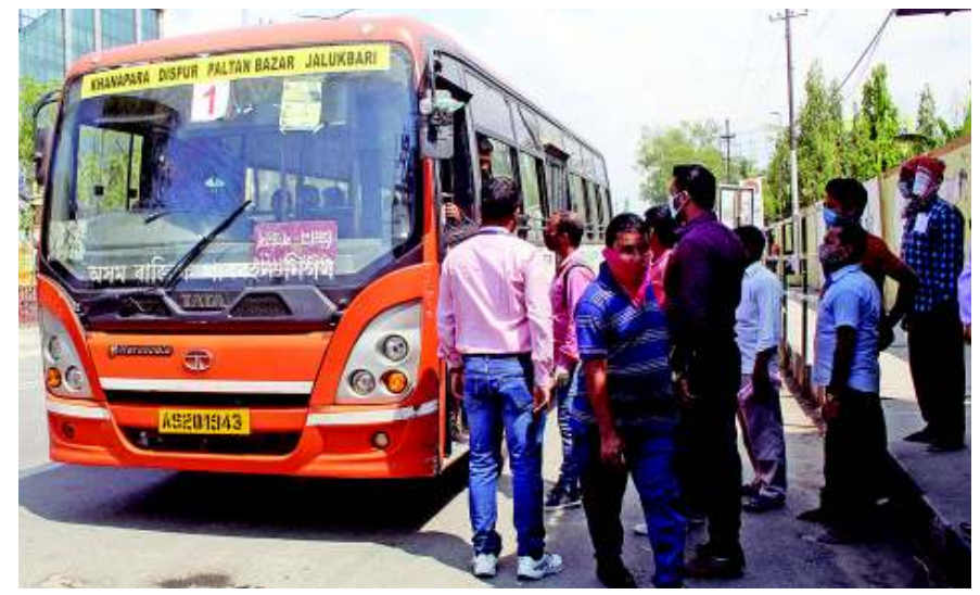
Passengers await their turn to board an ASTC-run city bus maintaining social distancing, during the third phase of the nationwide lockdown, in Guwahati on Monday.

While shops were allowed to operate till 5 pm, police at many places were seen enforcing it among violators. Police also took to announcements to enforce the night curfew, which began at 6 pm. Security personnel were seen chasing commuters who were out on the roads after 6 pm at many locations.