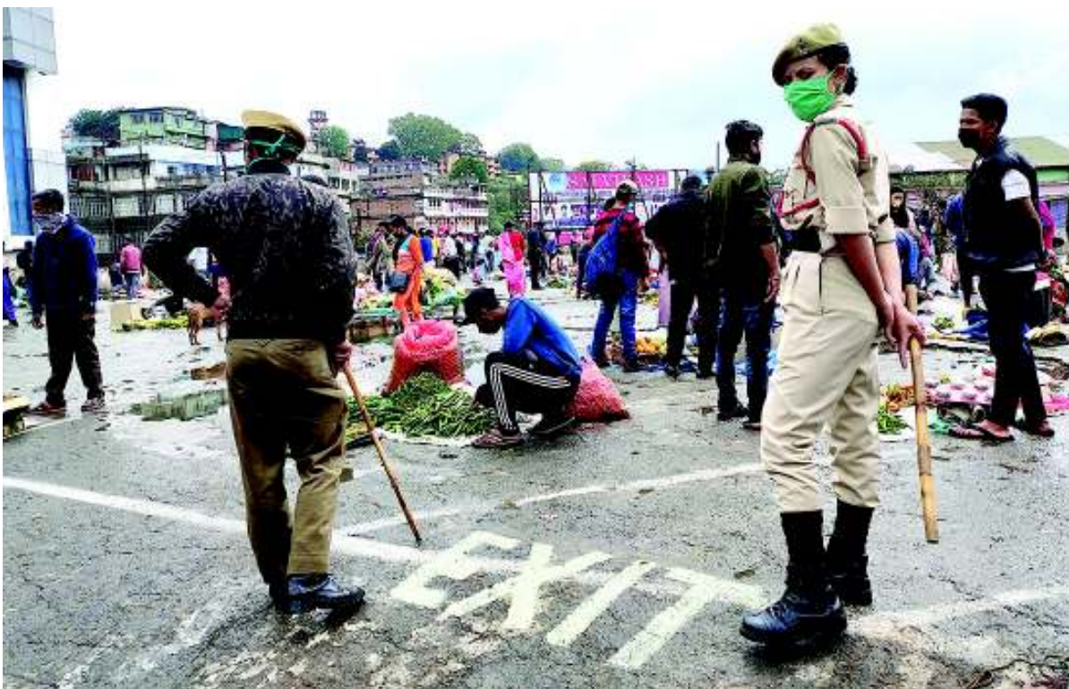
Police ensure maintaining of social distancing at a vegetable market at Garikhana parking slot in Shillong, on Monday.

The NGO further appealed to the authorities to strictly monitor the entry and exit points of the state border, while enforcing proper medical screening and regulate the movement of people.