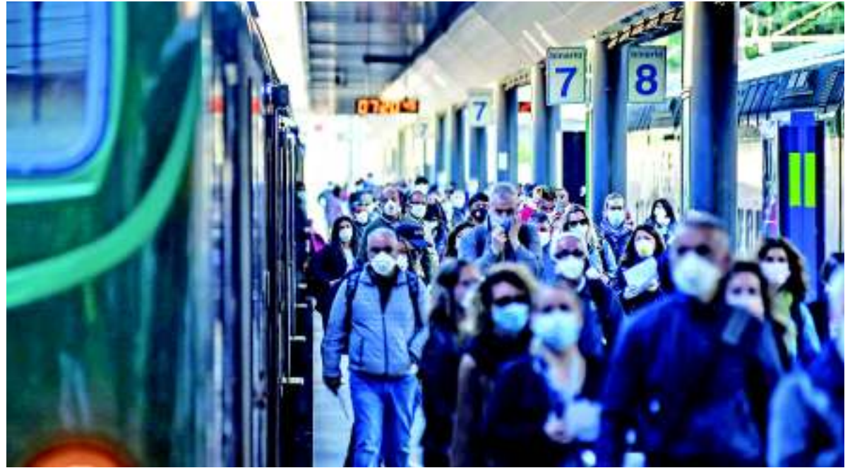
Commuters crowd Cadorna train station in Milan, Italy on Monday. Italy began stirring again after a two-month coronavirus shutdown, with 4.4 million Italians able to return to work and restrictions on movement eased in the first European country to lock down in a bid to stem COVID-19 infections.