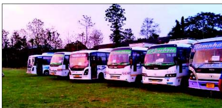
A fleet of buses meant to ferry Manipur returnees, parked at the Jiribam Higher Secondary School on Tuesday.