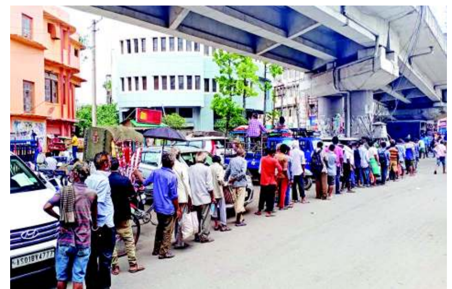
People stand in queue to receive food being distributed by an NGO at Athgaon, in Guwahati on Tuesday.