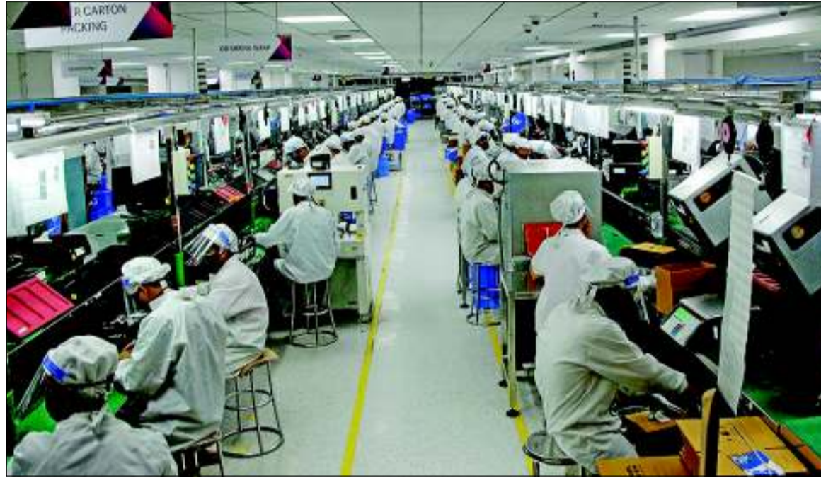
Employees at Lava mobile phone manufacturing unit resume operations after 40 days of closure due to the coronavirus-induced lockdown, in Noida on Tuesday.

Samir Jasuja, Founder & MD of PropEquity, however, was of the view that the approval for 100 per cent FDI in ready-to-move-in RERA-registered projects would have a limited impact as the number of completed projects is very low in the country in comparison to the under-construction projects. "It may have some impact on the ready-to-move-in luxury segment but that too is a very small market," Jasuja said. — IANS