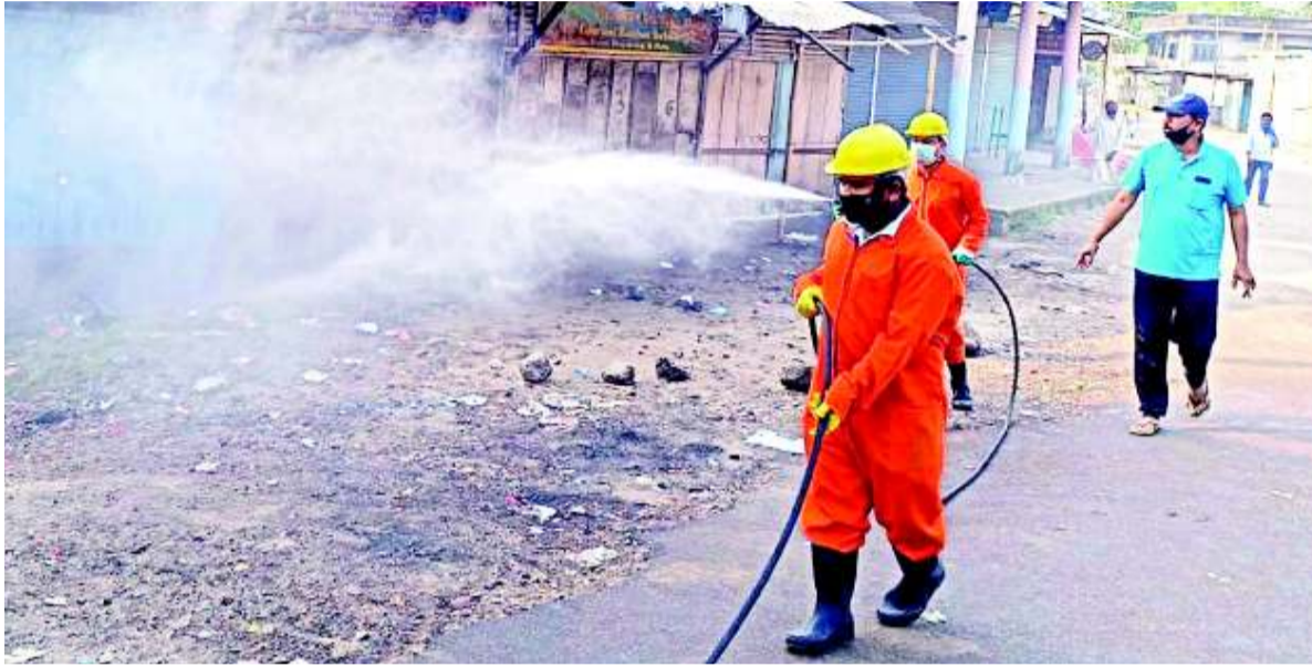
Civics workers spraying disinfectants in a North Lakhimpur municipality area, on Tuesday.

Local officials including the DC, SP and their subordinates today reviewed the preparations to receive the passengers, as per the COVID-19 protocol. It is expected that after the first day's anxieties, the exercises would get streamlined as the days progress. The local authorities today also had discussions with hotel, guest house and lodge owners here to use their premises as quarantine facilities. The owners have assured the administration of their full cooperation and to offer their places as and when any need arises.