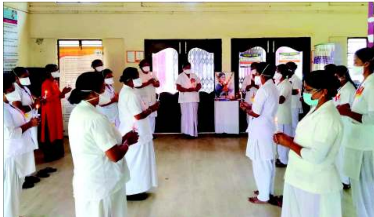
Nurses celebrating International Nurses' Day at a hospital, amid the ongoing COVID-19 nationwide lockdown at Sonari in Charaideo district, on Tuesday.