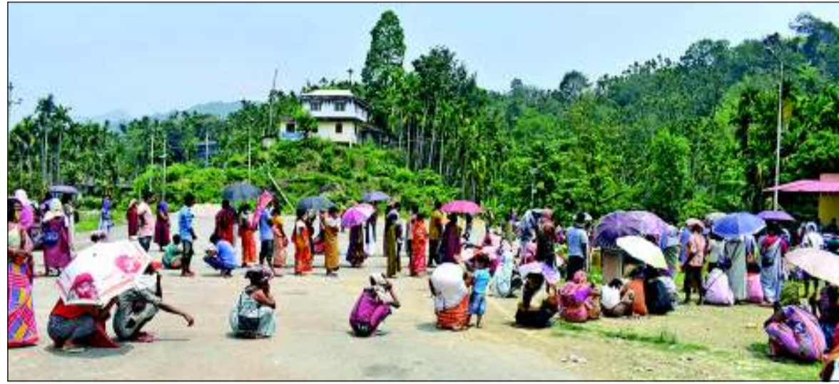
Needy villagers receiving food items during a distribution programme at Umkiang village in East Jaintia Hills district of Meghalaya on Tuesday.