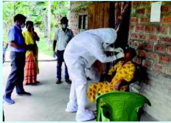
A health worker taking nasal swabs from a person for COVID-19 sample collection at Bakaliaghat, on Tuesday.