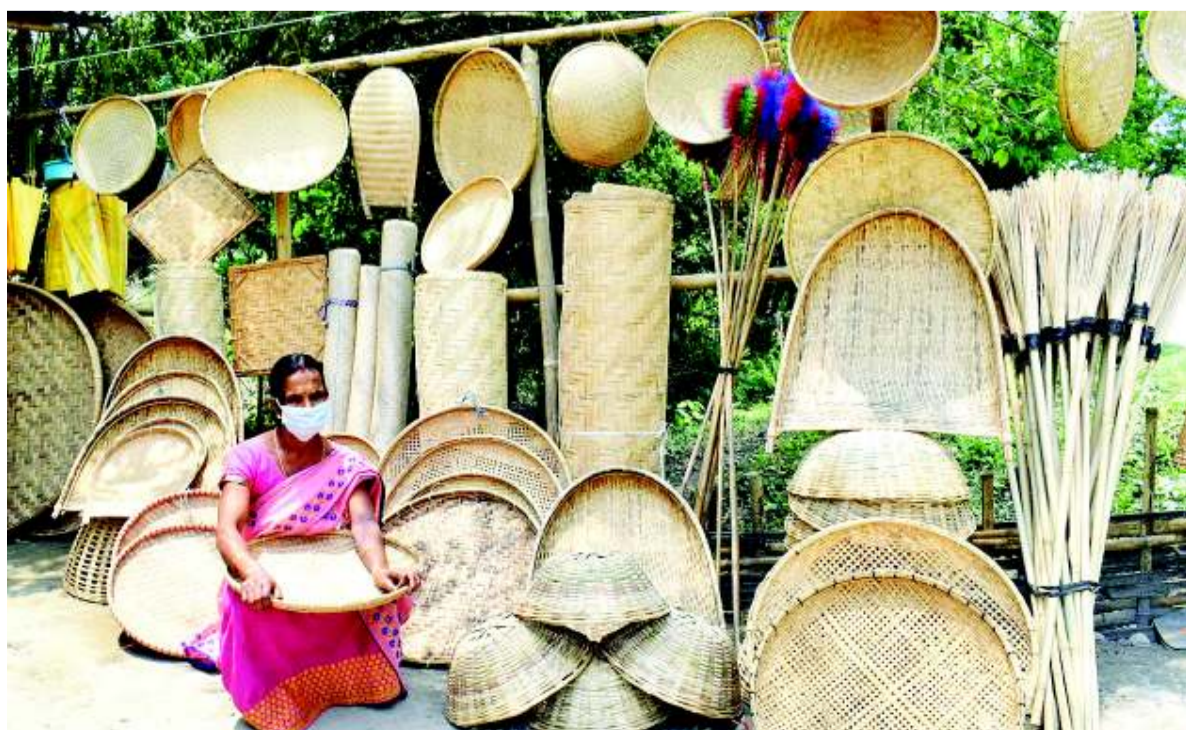
Wearing a face mask, a street vendor selling bamboo and cane products, at Dhakuakhana on Tuesday.

DOOMDOOMA, May 12: Along with the rest of the world, International Nurses Day was observed at Kakopothar here on Tuesday. On this occasion, the nurses of Kakopothar Public Health Centre (KPHC) lit earthen lamps and offered floral tributes to the portrait of Florence Nightingale. Later, the nurses distributed masks among the staff and the customers of Central Bank of India, Kakopothar branch. As a mark of gratitude for their dedicated service in this critical situation, the nurses of the PHC were felicitated with a gamusa each by the Greater Kakopothar Journalists' Association (GKJA). - Correspondent