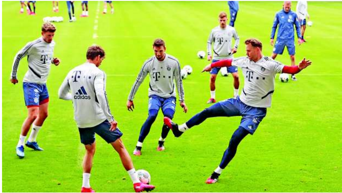
Bayern Munich players during a training session at FC Bayern Campus in Munich, Germany. Bayern Munich will face 1. FC Union Berlin on May 17 when the Bundesliga will resume after the forced break due to the ongoing coronavirus crisis.

pealed to their supporters before they resume their season against Gladbach on Saturday.