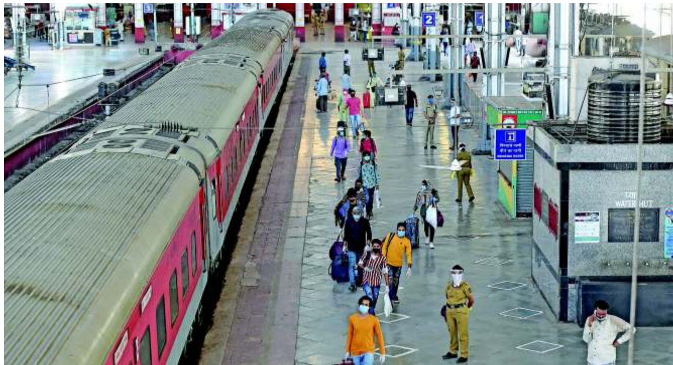
People with their luggage walk to board a special train for New Delhi after resumption of passenger train services by the Indian Railways in graded manner amid ongoing COVID-19 lockdown, at Mumbai Central Railway Station in Mumbai on Tuesday.

The trio had forged e-passes for travel from Panvel to Jalna during the COVID-19 lockdown, the official said.