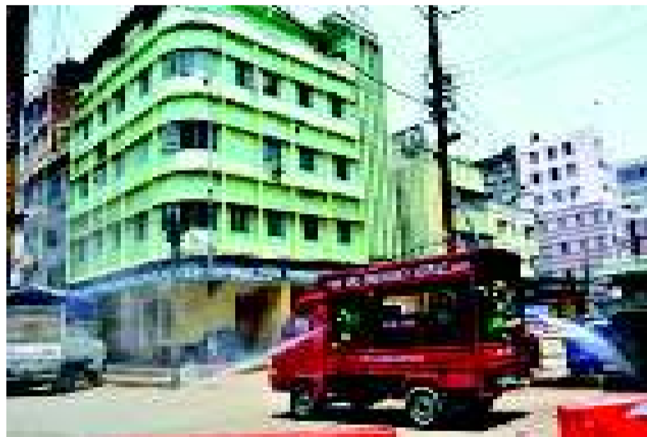
The Fancy Bazar area that was declared containment zone being sanitized, in Guwahati on Tuesday. – UB Photos

During their interaction with Modi on Monday, several chief ministers favoured extending the lockdown while a number of others pitched for allowing economic activities to resume to provide relief to millions of poor hit by the stringent measure. – PTI