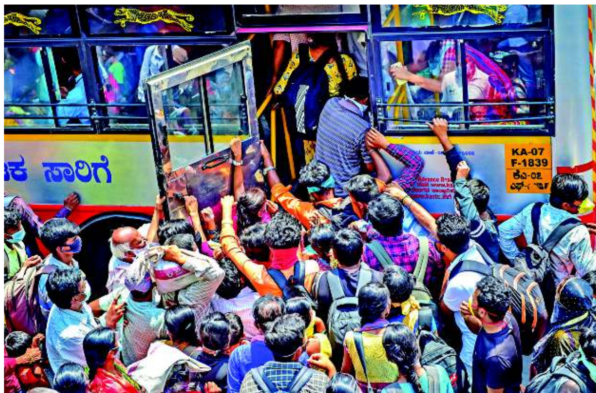
Stranded people boarding a special government-arranged bus to reach their respective native places, amid the lockdown in Bengaluru on Sunday. - PTI

Meanwhile, the Kerala Government has asked those stuck outside the State to apply for pass so that they can enter the State through the borders, which it shares with Tamil Nadu and Karnataka. - IANS