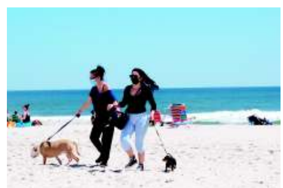
Beachgoers wear face masks at Island Beach State Park in New Jersey on Saturday on the day New Jersey's state parks reopened after a closure brought on by the coronavirus outbreak. - AP/PTI

Following general-turned-president Abdel Fattah el-Sissi's rise to power in 2013, most of Egypt's television programmes and newspapers have taken the government position and steered clear of criticism, or else disappeared. Many privately-owned Egyptian news outlets have been quietly acquired by companies affiliated with the country's intelligence service. - AP