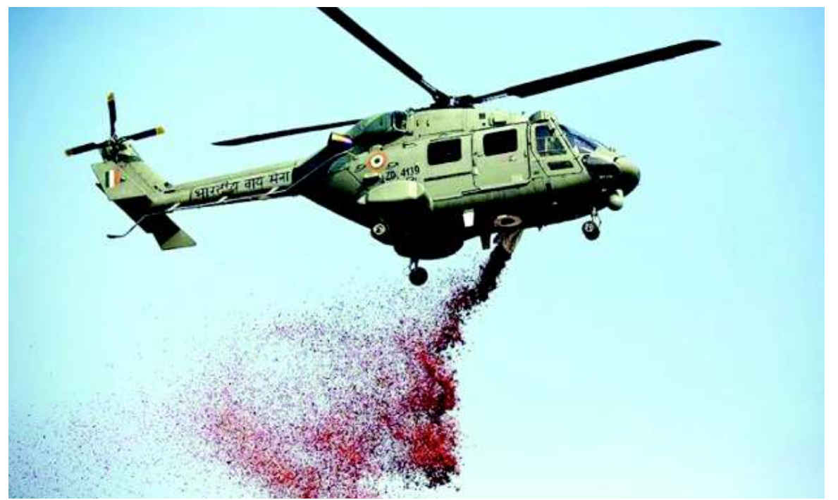
An IAF chopper showering petals over a COVID-19 hospital at Dimapur on Sunday.

Earlier, Congress leaders and workers had faced threats and intimidations at Belonia, Khowai and Teliamura from the BJP supporters but nobody has been arrested yet.