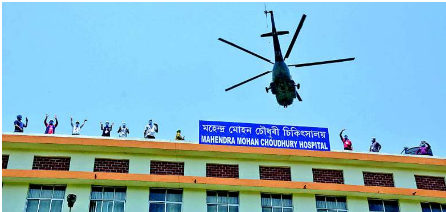
An Indian Air Force helicopter flies past the MMCH in Guwahati to express gratitude towards medical professionals fighting the COVID-19 pandemic. This exercise is part of 'India Salutes Corona Warriors' campaign organised across the country.

Times have changed. Now you can't even bargain with the shopkeepers!