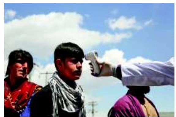
A health worker checks the temperature of car passengers in an effort to help prevent the spread of the coronavirus, as they enter the city in the Paghman district of Kabul, Afghanistan on Sunday. - AP/PTI

More than 700,000 Rohingya Muslims came to Bangladesh starting in August 2017, when the military in Buddhist-majority Myanmar began a harsh crackdown against them in response to an attack by insurgents. Global rights groups and the UN have called the campaign ethnic cleansing involving rapes, killings and torching of thousands of homes. Currently more than 1 million Rohingya live in Bangladesh. - AP