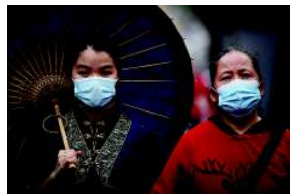
A woman dressed in traditional costume holding an umbrella walks next to another woman, both wearing protective face masks, to help curb the spread of the new coronavirus as they visit the capital's popular tourist spot of Nanluoguxiang reopened for tourists following the coronavirus outbreak in Beijing, on Sunday. From the United States to Europe and Asia, people in many parts of the world are emerging from their homes as virus-related restrictions begin to ease and springtime temperatures climb.