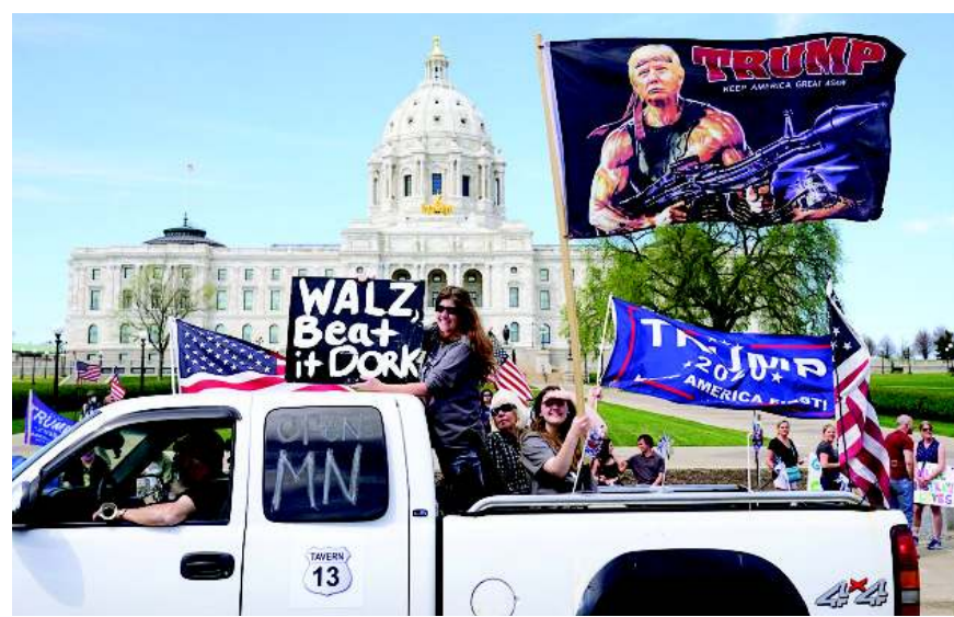
Supporters of President Donald Trump circle the State Capitol as they protest Governor Tim Walz's "Stay Home MN" orders meant to slow the spread of COVID-19 on Saturday, in St Paul, Minnesota.

"The elephant in the room is that the baseline general health in many Western populations was already in a horrendous state to begin with. In the UK and US, more than 60 per cent of adults are overweight or obese," he pointed out. - PTI