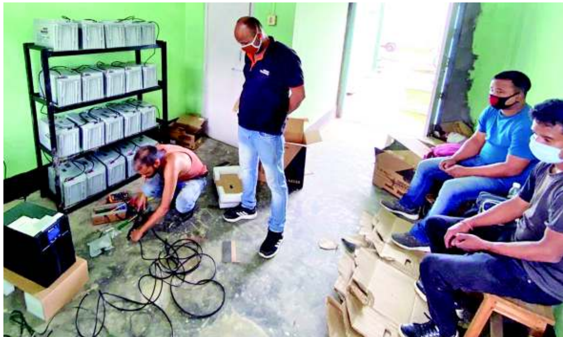
A COVID-19 testing centre being set up at the Tura Civil Hospital on Sunday.

The Chief Minister advised the Department of Horticulture and Soil Conservation to support farmers and FPCs to start cultivation of short duration high-value crops the suit the present climatic condition.