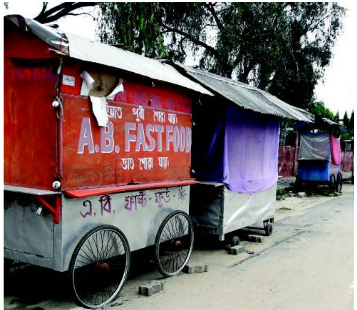
Rusting in peace: Hand-pulled carts that deal in fast food lie idle along the Tulsi Narayan Sarma Path in Jorhat during the nationwide lockdown to break the COVID-19 transmission chain, on Sunday.