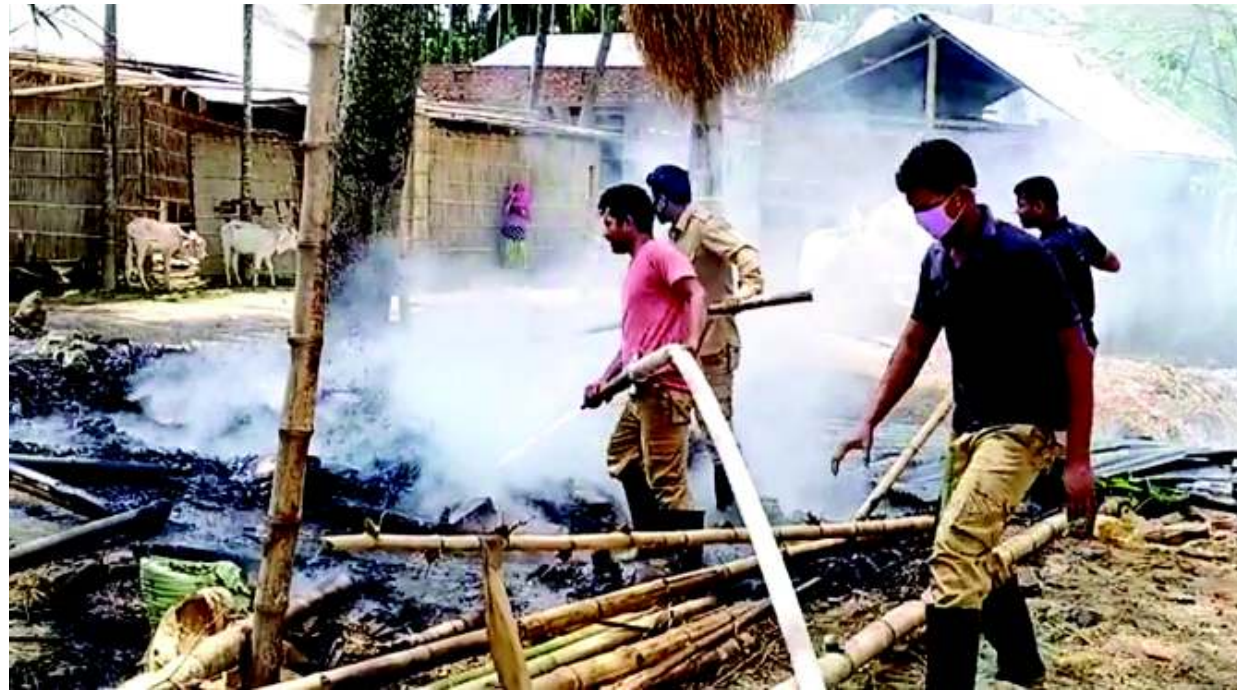
Remains of the day: Fire fighters dousing the flames which razed the mosque to the ground.