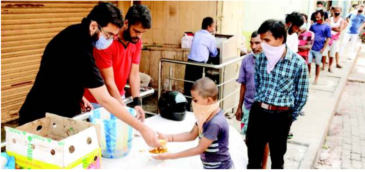
Food being distributed among needy people at Fancy Bazar during the lockdown, in Guwahati on Sunday.