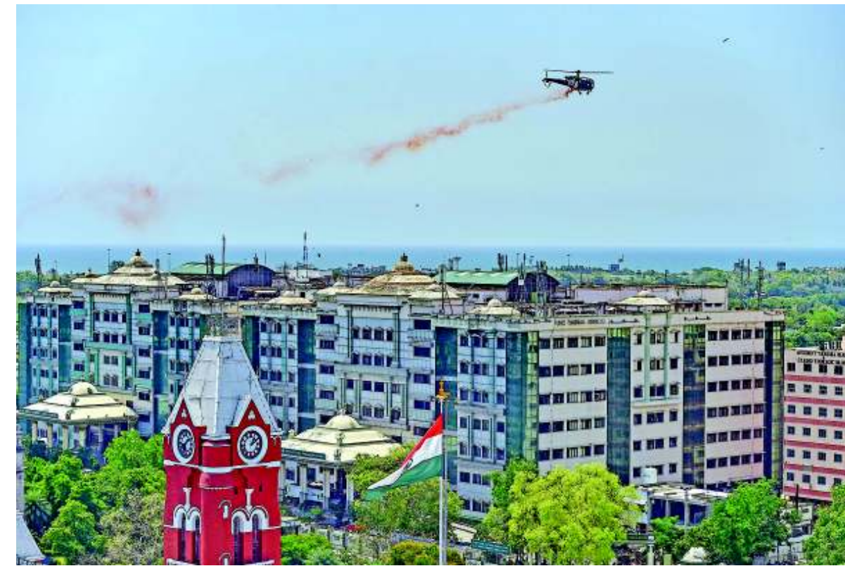
An IAF chopper flies over Rajiv Gandhi Government General Hospital to express gratitude towards medical professionals for their contribution in fight against COVID-19, in Chennai on Sunday.