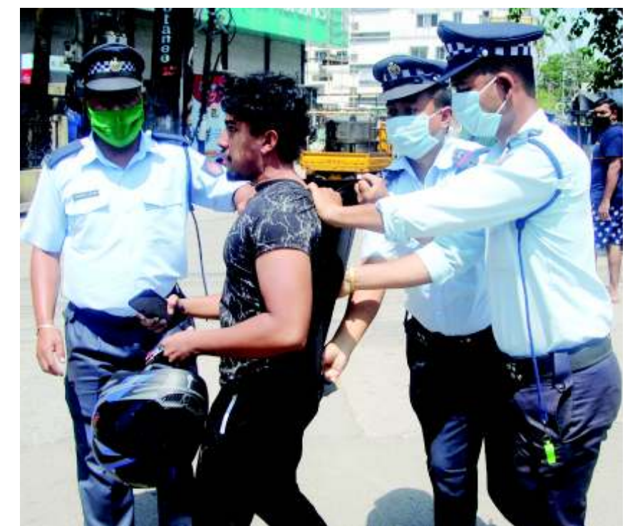
Police capture a youth for violation of lockdown norms, at Lachit Nagar in Guwahati on Sunday.