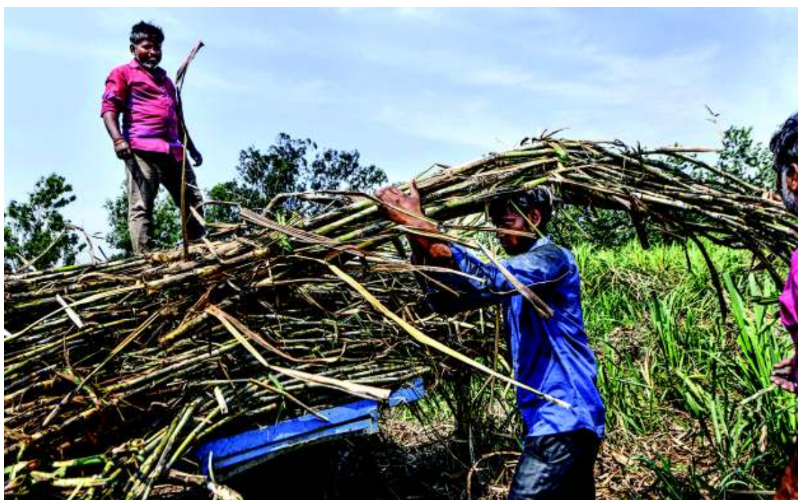
Farmers load harvested sugarcane crop on a tractor during the ongoing COVID-19 lockdown, in Muzaffarnagar on Sunday.

Assam produces 52 per cent of the total Indian tea and this constitutes 12 per cent of the total global production of 6 billion kg.