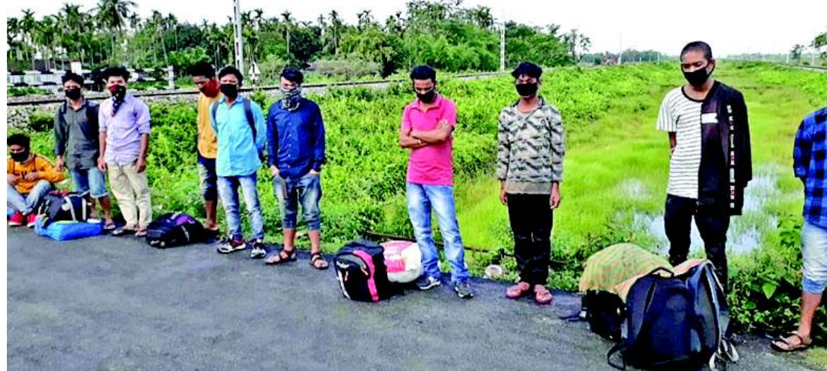
The 16 youths who came on foot from Siliguri to Gossaigaon.