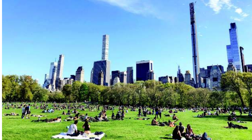
People practice social distancing while enjoying the pleasant weather at Central Park's Sheep Meadow on Saturday in New York. New York City police dispatched 1,000 officers this weekend to enforce social distancing as warmer weather tempted New Yorkers to come out of quarantine.