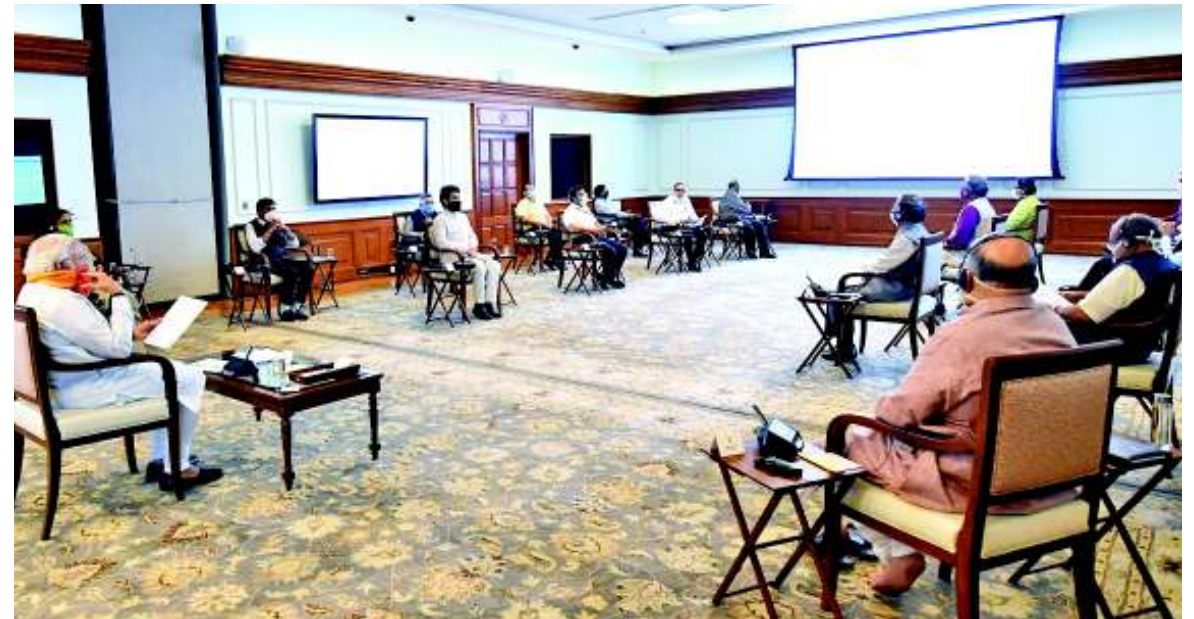
Prime Minister Narendra Modi chairing a meeting to discuss ways to boost the agriculture sector, in New Delhi on Saturday. – PIB

He asserted that the “clarification should come from the right quarters. Not only the Centre, it is the duty of the State governments to issue that clarification because most of the issues are under the domain of the State governments...” – PTI