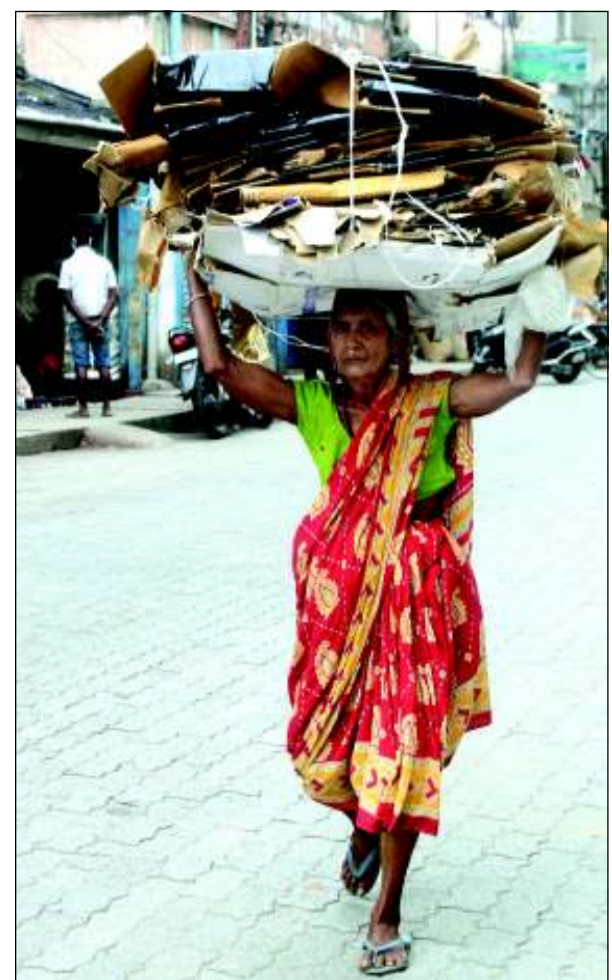
Working to live: An old woman carries a load of discarded cartons amid the COVID-19-induced lockdown, in Guwahati on Thursday.

"The drive was conducted at Dispur, Beltola Survey, Beltola Tiniali, Beltola Bazar, Jayanagar Chariali, Six Mile, VIP Road, Basistha Chariali and Latakata at Basistha. We also checked the social distancing norms, round marking, use of masks, licence, permission, price listing and hygiene of the allotted vendors," a source in the GMC said.