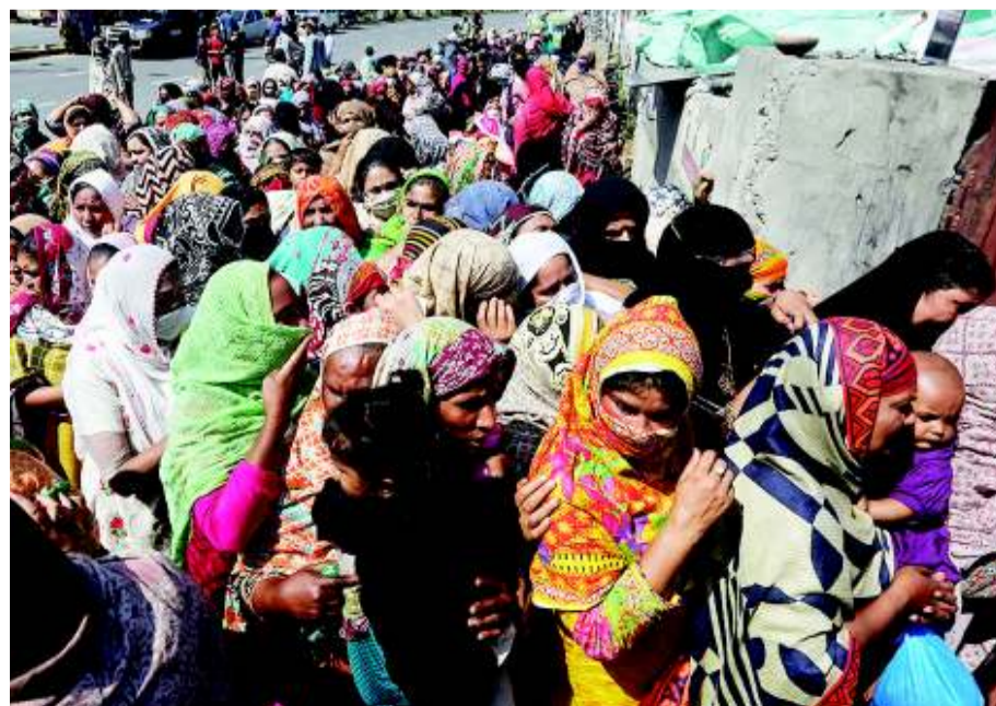
People wait to receive food assistance ahead of the Muslim fasting month of Ramadan, during a government-imposed nationwide lockdown to help contain the spread of the coronavirus in Lahore, Pakistan on Thursday. Ramadan begins with the new Moon later this week as Muslims all around the world are trying to work out how to maintain the many cherished rituals of Islam's holiest month amid the coronavirus pandemic.