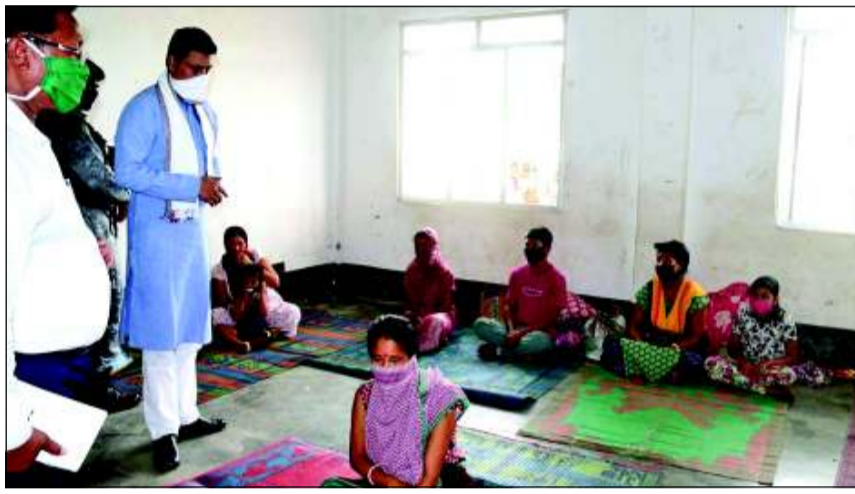
Tripura Chief Minister Biplab Kumar Deb visiting a relief camp set up for storm-hit people at Chikancherra in Sepahijala district on Thursday.

Meanwhile, the State Government has decided to engage the Tripura State Rifles (TSR) along the Indo-Bangladesh border as a second line of defence to prevent any infiltration from across the border. The decision was taken in view of the rapid spread of coronavirus in Brahmanbaria district of Bangladesh during the last few days.