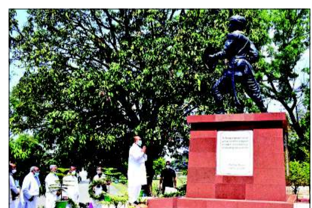
Manipur Chief Minister N Biren Singh paying homage on Paona Brajabasi's statue in Thoubal district on Thursday.