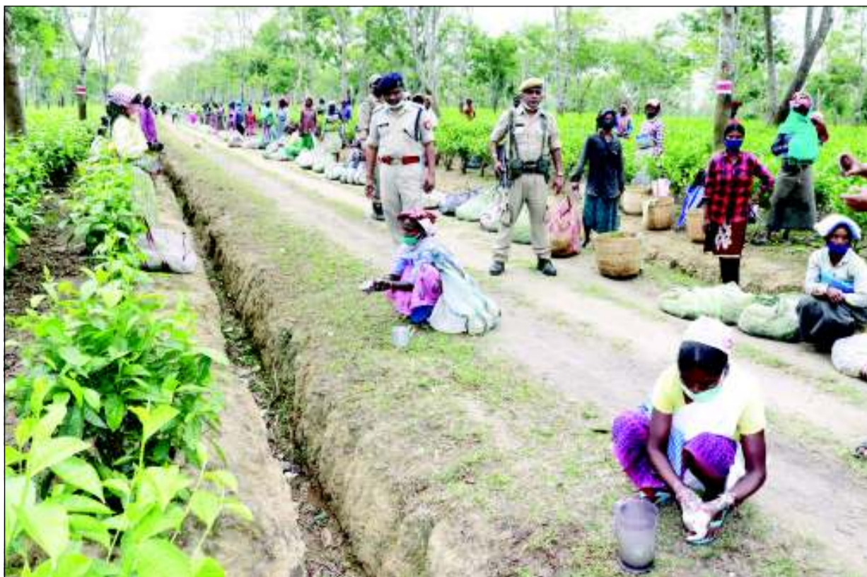
Labourers washing their hands and covering their faces with masks during a COVID-19 awareness workshop organized by the Assam Police at Naharoni Tea Estate, Rangapara of Sonitpur district, on Thursday.