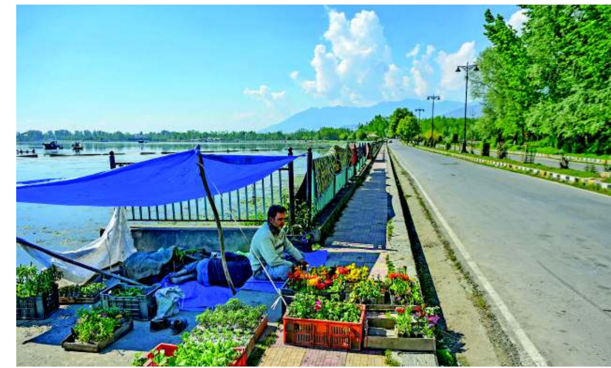
A roadside flower vendor awaits customers, during the nationwide lockdown to curb the spread of coronavirus, in Srinagar on Thursday.