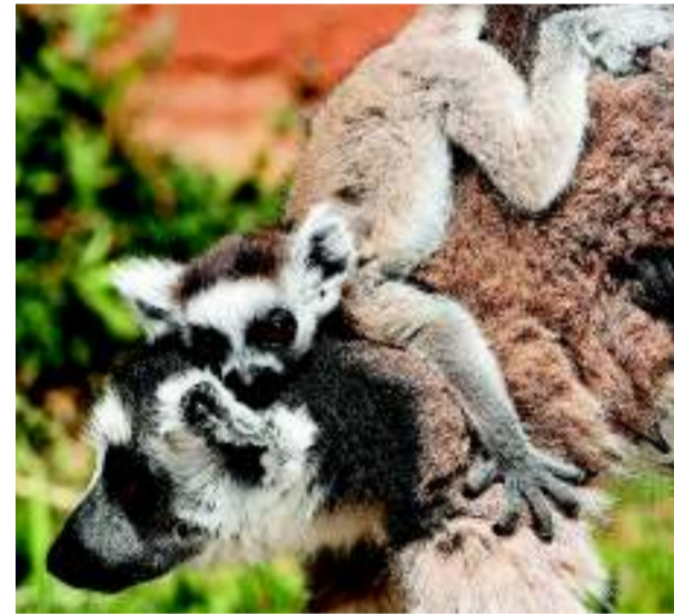
Newborn ring-tailed lemurs play inside the shuttered Attica Zoological Park, in Spata, east of Athens on Thursday. Five lemurs were born after the site was closed to the public as part of health restrictions for the new coronavirus pandemic. The government is planning next week to ease restrictions against the COVID-19 which has so far help keep infection rates low in Greece. - AP/PTI

The coronaviruses carried by the bats part of the study are different from the one behind COVID-19, the scientists cautioned, adding that learning about these viruses in bats can help better understand the pandemic causing virus. - PTI