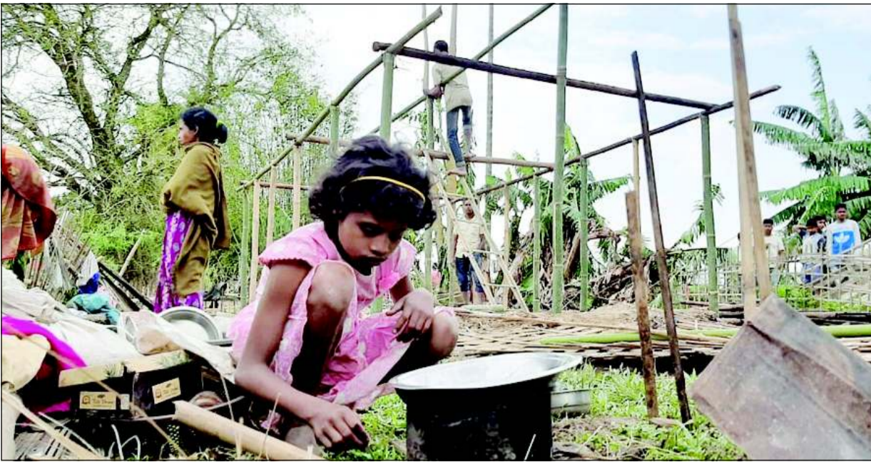
Struggling to keep body and soul together, a minor girl tries to cook a meal as her house lies in ruins following the thunderstorm which devastated Tengakhat Nepali Gaon in Dibrugarh district, on Wednesday.