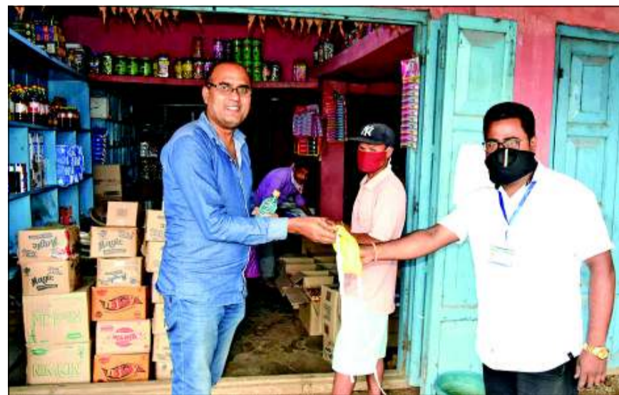
Masks being distributed to shopkeepers by the members of the Bakaliaghat Town Committee on Thursday.