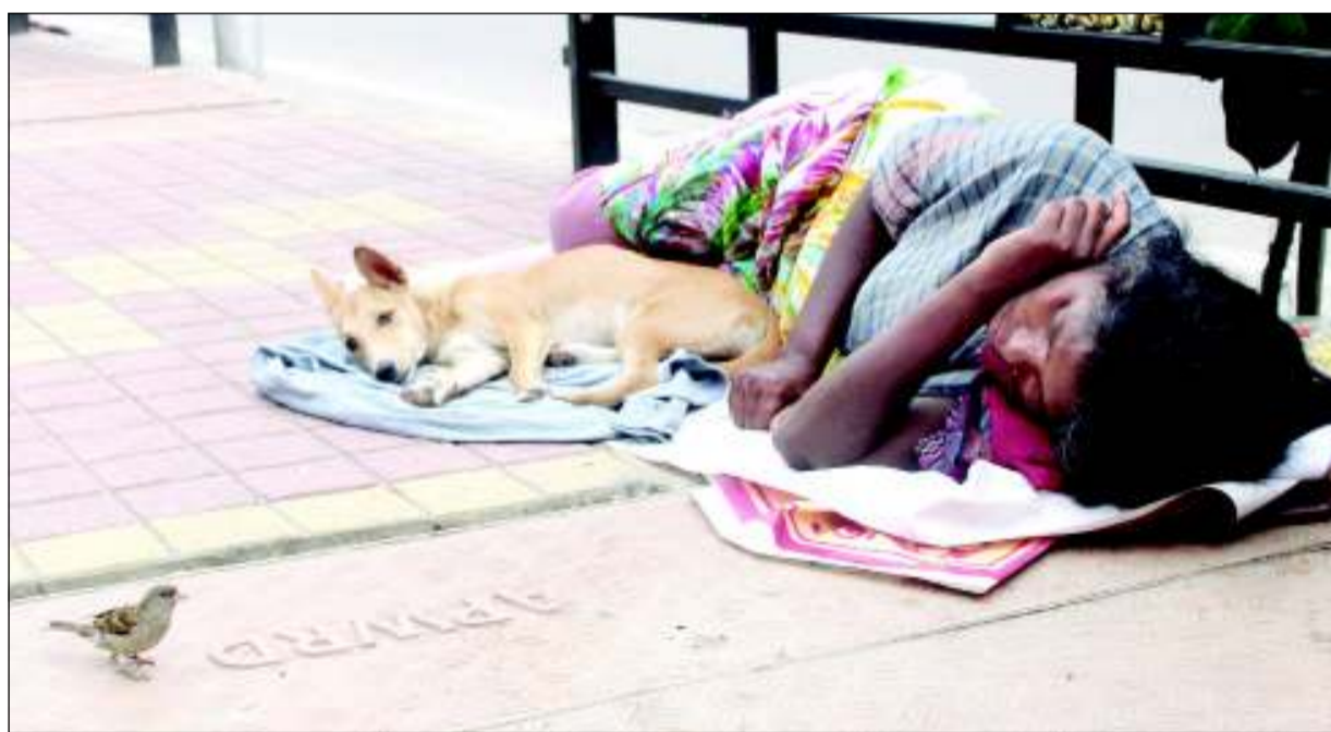
Forget social distancing! A dog sharing bedspace with a destitute woman on a footpath even as a sparrow hops about nearby, in Guwahati on Thursday.

The statement urged the government not to compel the railwaymen to intensify their agitation which may cause serious industrial unrest in the country.