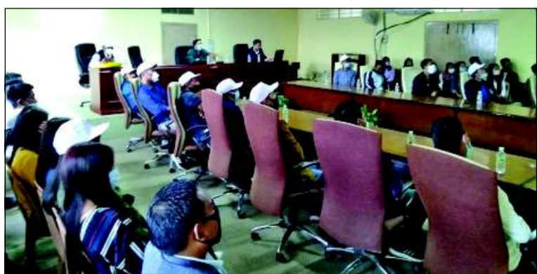
Volunteers attending a training programme on tackling COVID-19 at Mon town in Nagaland on Thursday.