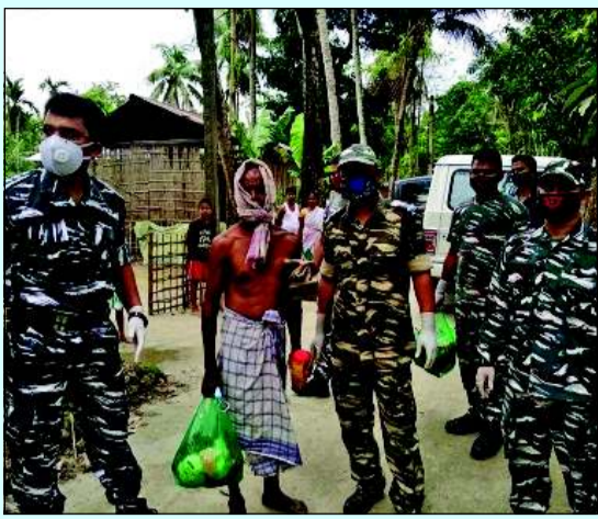
Officers of the CRPF's 10th Battalion F Coy distributing relief materials in Patacharkuchi on Wednesday.