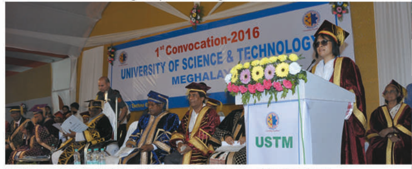
Dr Ampareen Lyngdoh, Minister of Science and Technology, Govt of Meghalaya delivering address at the Convocation

Hon'ble Governor of Meghalaya delivering the Convocation Address