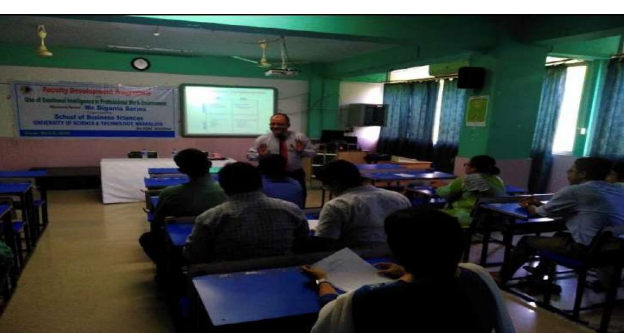
Few representative photographs during various sessions