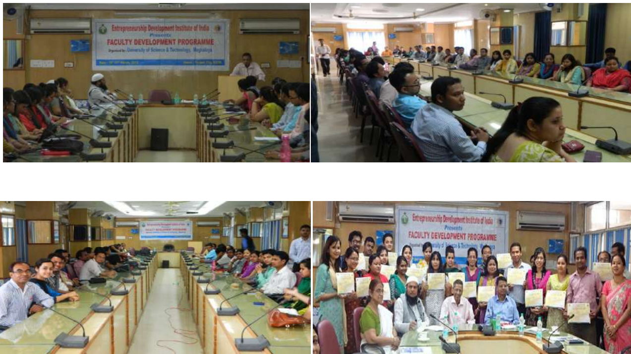
Few representative photographs of the FDP