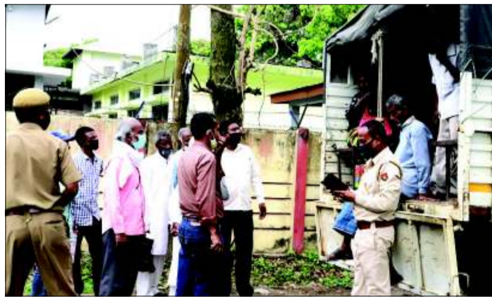
Family members receiving prisoners released from the detention camp in Tezpur Central Jail on parole during the nationwide lockdown in the wake of COVID-19 outbreak at Tezpur, on Tuesday.