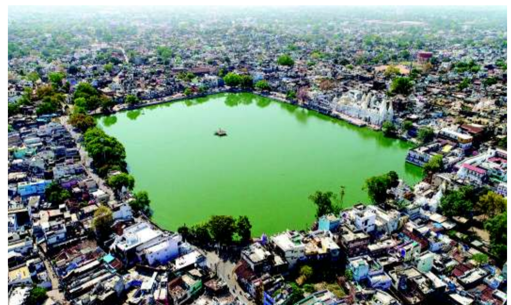
An aerial view of the areas around Hanumantal Lake in the COVID-19 red zone district of Jabalpur on Tuesday. – PTI

Khalid had given provocative speeches at two different places and appealed to the citizens to come out on streets and block the roads during the visit of US President Donald Trump to spread propaganda at international level about how minorities in India are being treated, the FIR alleged. – PTI