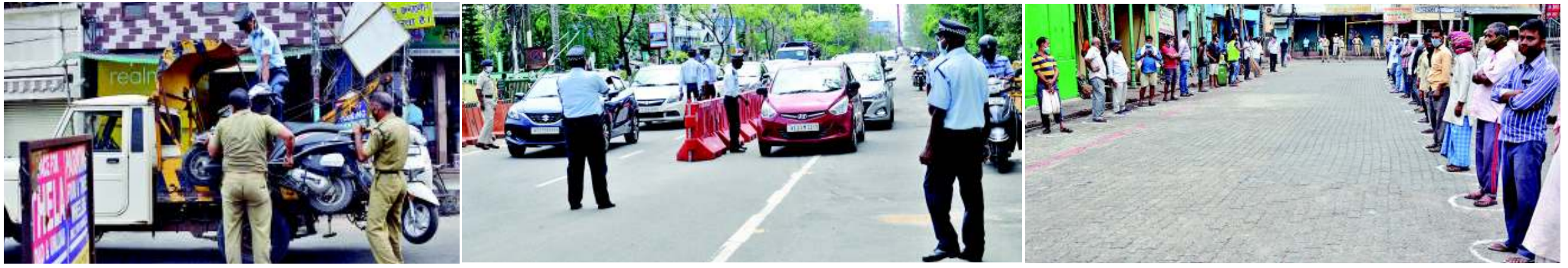
(From left) Two-wheelers seized from lockdown violators being loaded onto a tow-away van; police personnel control vehicular traffic; people maintain social distancing as they wait to make purchases at a shop, in Guwahati on Tuesday.