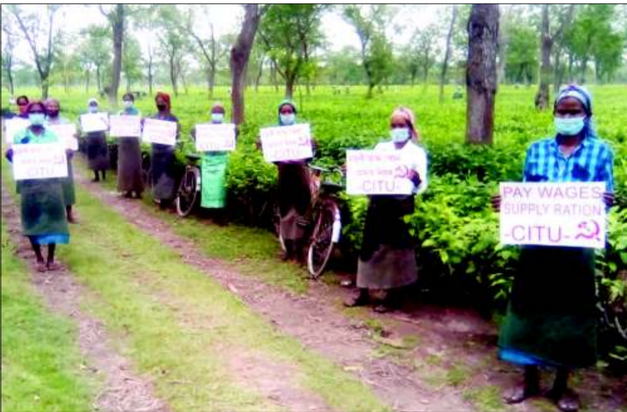
Workers of Kokrajhar tea estate staging a protest in demand of timely payment of wages and ration, on Tuesday.