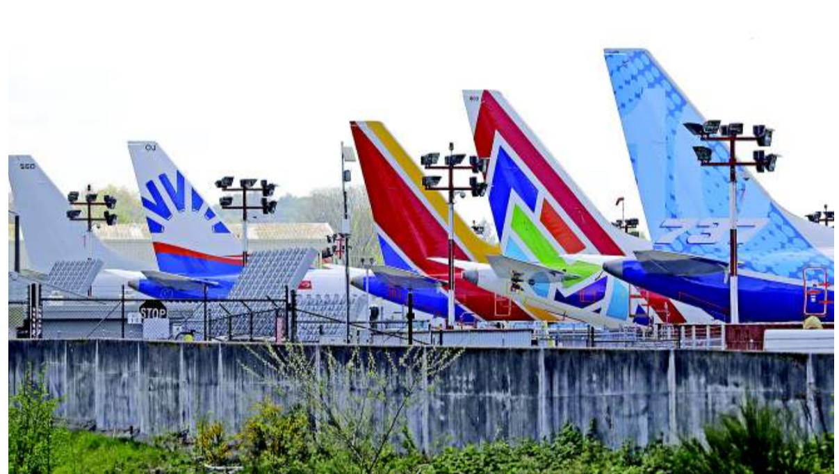
Boeing 737 MAX jets parked on an airfield adjacent to a Boeing production plant in Renton, Washington on Monday.