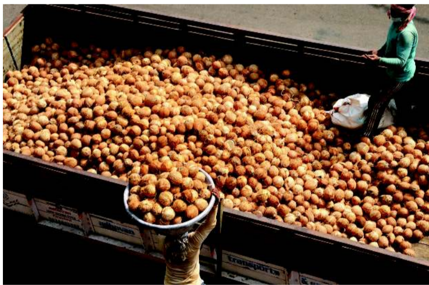
Labourers load coconuts on a truck during the nationwide COVID-29 lockdown at Padianilam in Kozhikode on Tuesday.

Rajasthan had started conducting tests through rapid testing kits on Friday in the State's hotspots, starting from Jaipur.