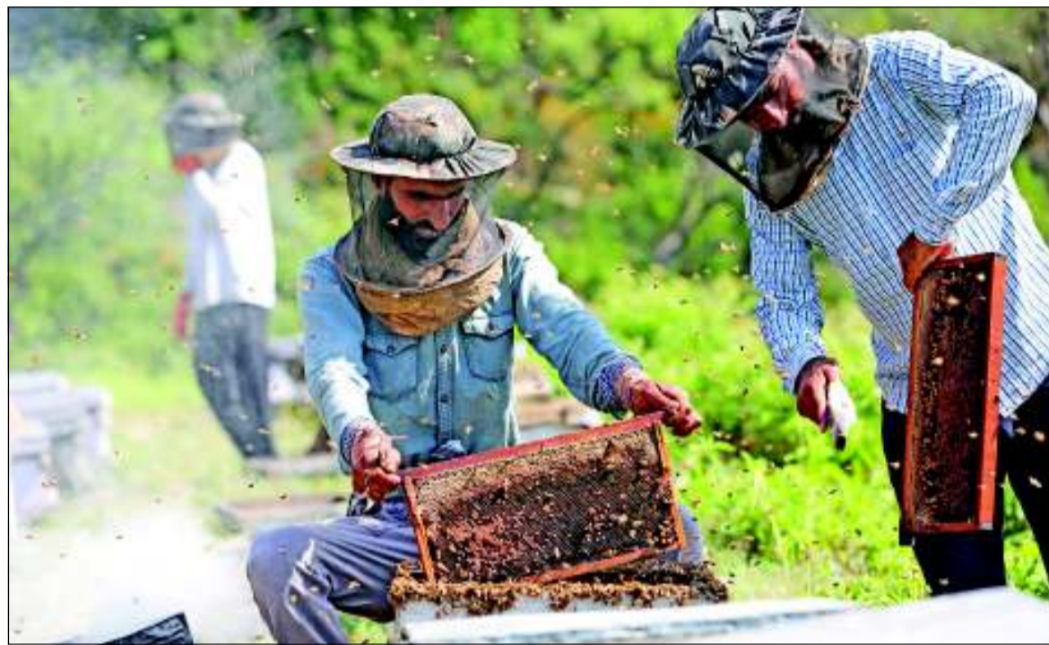
Beekeepers harvest honey from artificial beehives at an apiary during the nationwide lockdown imposed to contain the spread of the coronavirus, on the outskirts of Jammu on Tuesday.

The company said that warranty payments have been credited to dealers and the company would provide clearance on priority within 15 days post lockdown for all dealer invoices.