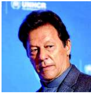
like symptoms and tested positive for the virus the following day, sources said. Faisal is the

ISLAMABAD, April 21 : Pakistan Prime Minister Imran Khan may go into self-quarantine after it emerged that he came in contact with an individual who tested positive for the novel coronavirus last week.