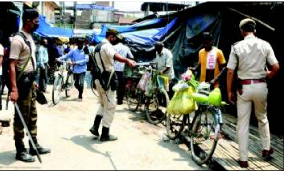
Police chasing away lockdown violators at a market in Nagaon, on Tuesday.