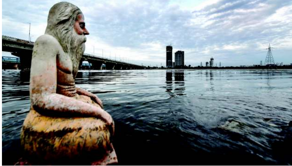
The Yamuna river in New Delhi, as seen on Monday. According to a report by the Delhi Pollution Control Committee, the biological oxygen demand levels in the river have improved by up to 33 per cent.