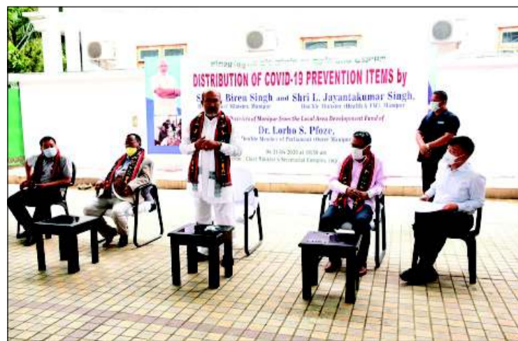
Manipur Chief Minister N Biren Singh speaking at a programme held for distribution of medical items, in Imphal on Tuesday.

In his speech, MP Lorho said that 13 out of the total 19 districts of the State partially or fully fall under the jurisdiction of the Manipur Outer