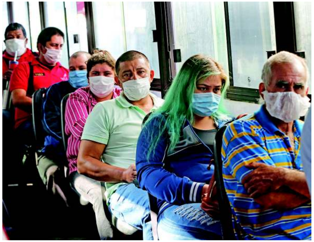
Commuters wearing masks to prevent the spread of novel coronavirus at Asuncion, Paraguay, on Monday.