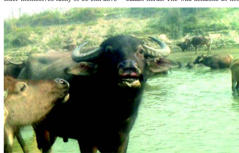
A bull stands guard as the herd wallows in a water body.

tack anyone they see even at a distance of 1 km. Several villagers have been injured or chased by the herd. They consider themselves lucky to be still alive