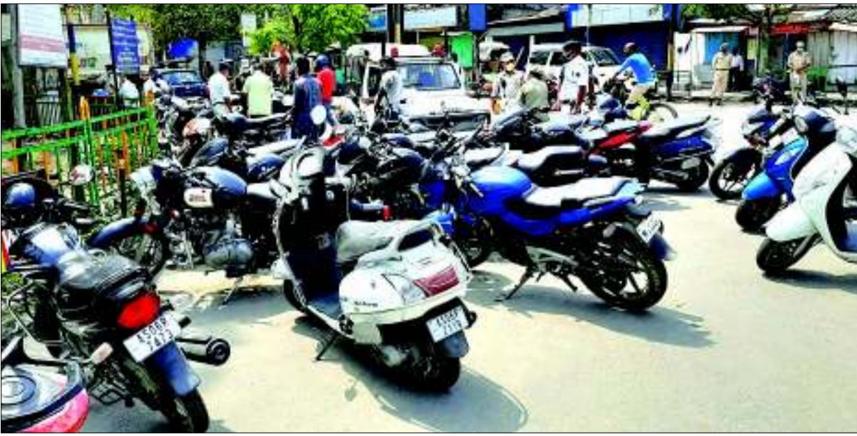
Seized vehicles during the lockdown period at a Dibrugarh police station, on Tuesday.