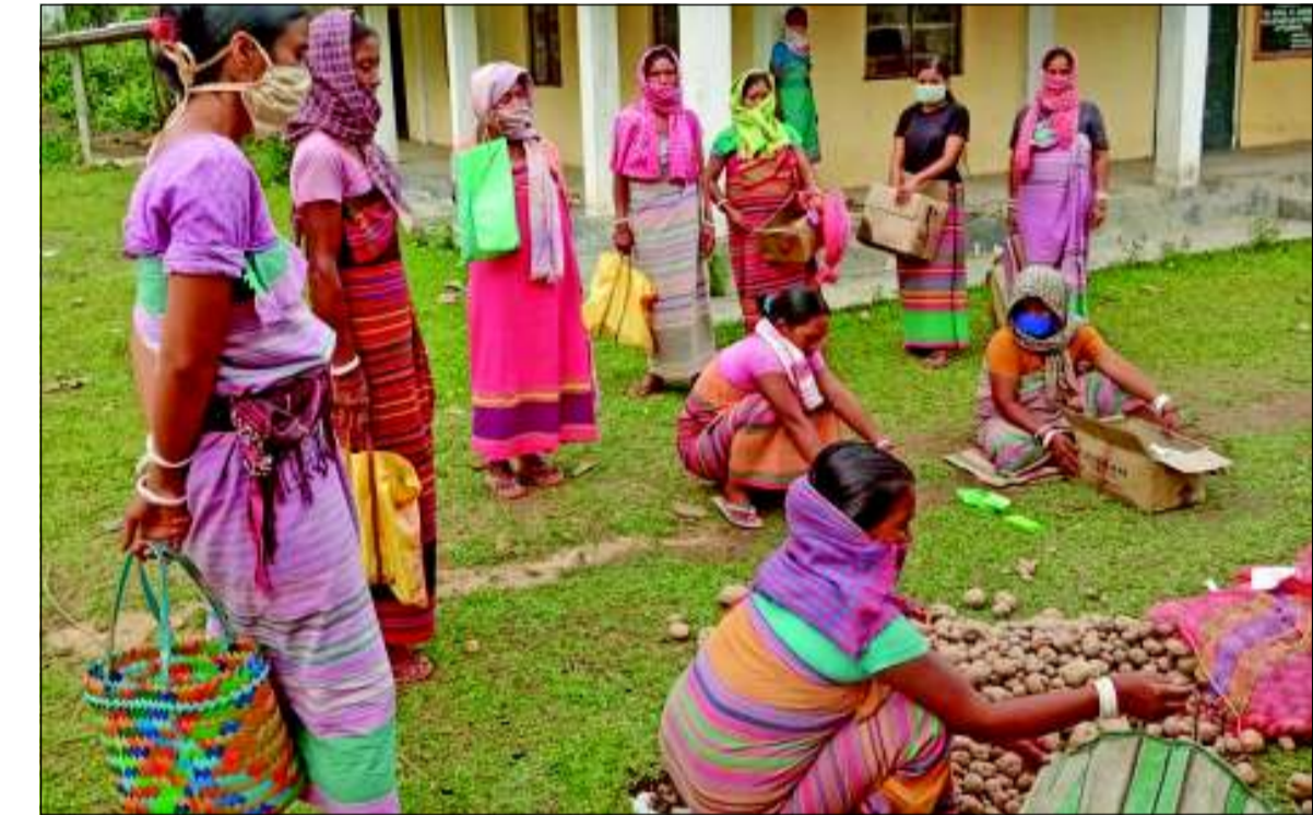
Beneficiaries receiving essential commodities being distributed by an NGO in South West Garo Hills, Meghalaya, on Tuesday.

The other accused is still absconding, stated a press release from the IPR Department here. – Correspondent