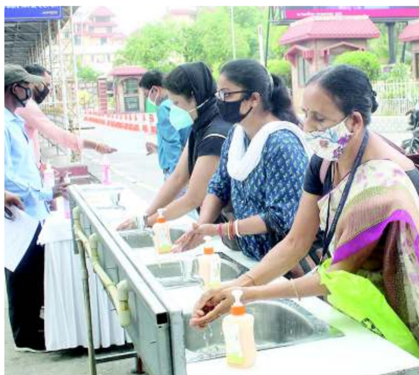
Employees washing their hands before entering Janata Bhawan in Guwahati on Tuesday. - UB Photos

The reopenings come as politicians grow weary of soaring unemployment numbers and the prospect of economic depression. Asian shares followed Wall Street lower on Tuesday after US oil futures plunged below zero because of a worldwide glut as factories, automobiles and airplanes sit idled. - AP